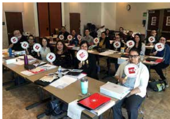
The second CCCiL workshop at Ovitt Library in Ontario, California.

NJSL entered year two of its Cross Cultural Communicators in Libraries (CCCiL) program after receiving a Laura Bush 21st Century Librarian Program grant award from the Institute of Museum and Library Services (IMLS) for $222,697. After librarians successfully completed the cultural competence training for year one, they will receive face-to-face workshops on interpretation and translation skills in year two.