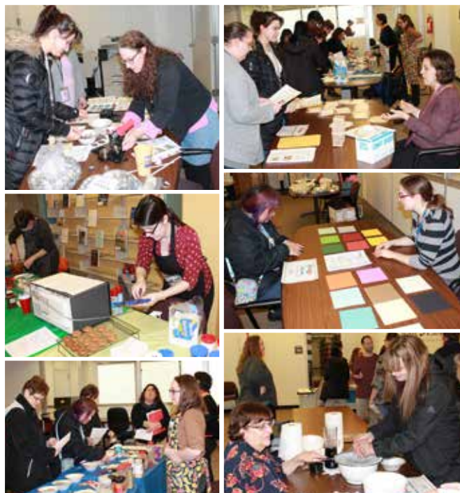
New Jersey Makers Day included button making, donuts, a spice rub station, popsicle stick shelves, origami, and seed bombs.

Additionally, NJSL partially sponsored makerspace sub-grants to New Jersey libraries.