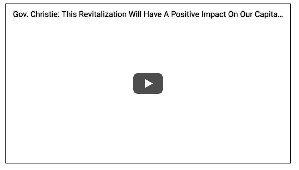
Watch The Video Here