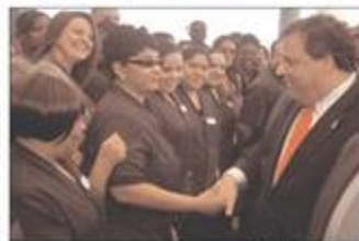
Gov. Chris Christie meets Revel workers lined up Tuesday at the main entrance during a tour of the new resort, which opens Monday.