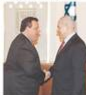
GOVERNOR CHRIS CHRISTIE of New Jersey stands with Prime Minister Benjamin Netanyahu yesterday.