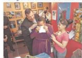
Gov. Chris Christie and a homeless woman in Ewing, N.J., as he calls for an end to homelessness in the state.