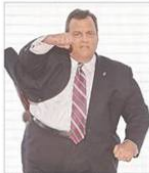
Gov. Christie takes the stage for a keynote speech at the Republican National Convention.

Christie says politicians must tell "hard truths."