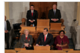
State of the State Address Jan. 12, 2016