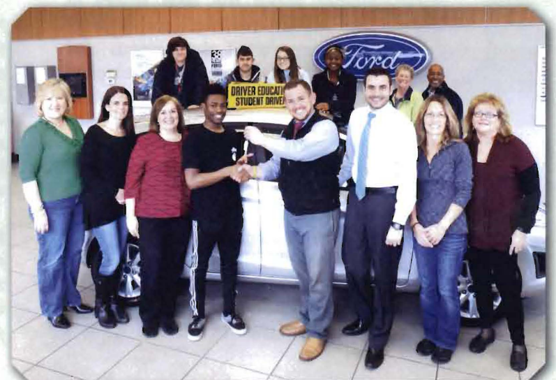
KPSEF members and Haldeman Ford employees hand over the keys