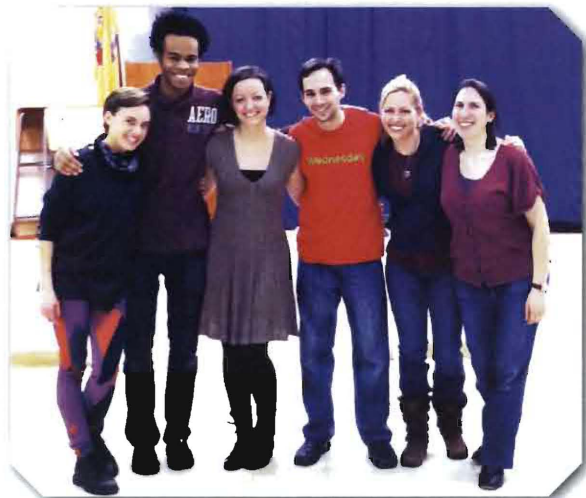
The Circus Club Volunteers