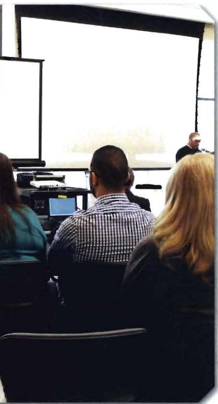
technology is presented at the of Technology" workshop