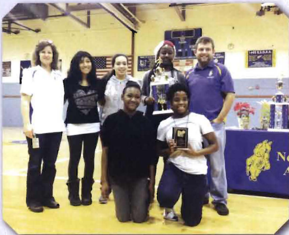
The Lady Colts placed 2 nd in the Tournament