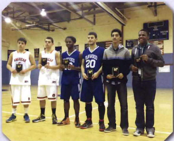
The All-Tournament Team