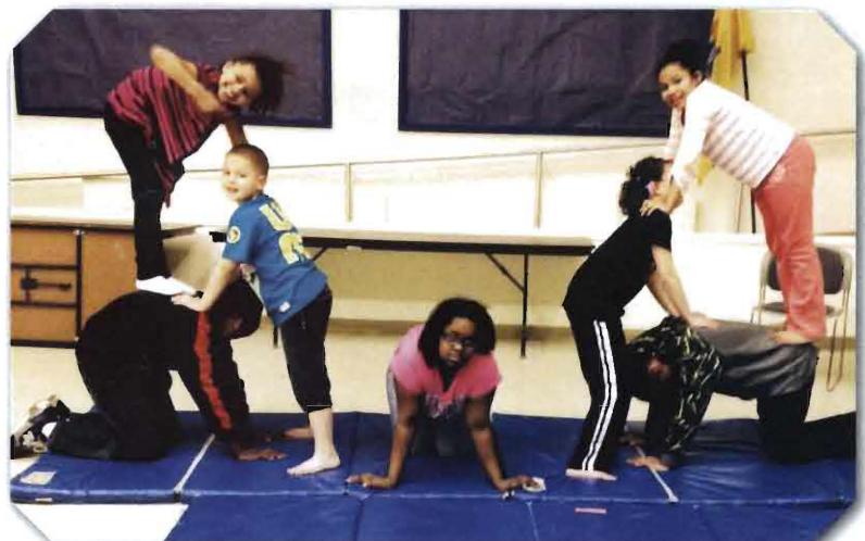
ELMS students work together during acrobatics