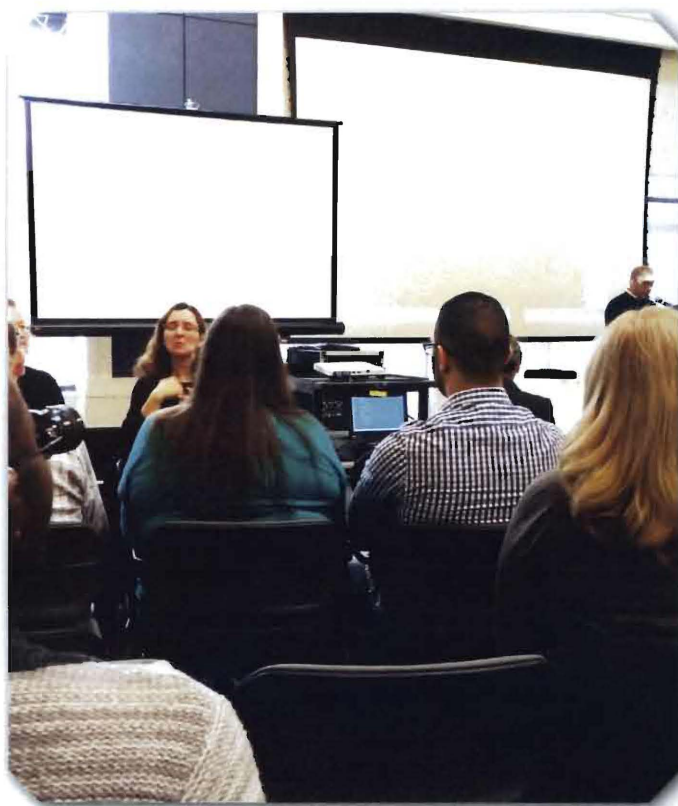
Various new technology is presented at the "Taste of Technology" workshop

On March 19 th , a few NJSD staff members and one of our students attended a workshop at The College of New Jersey to learn more about technology to assist people who are Deaf/blind or have low vision. During this all day workshop, attendees learned various services and technology that can provide assistance to those with vision problems. For example, NJ Relay showed a device that, using Braille, types into your phone or tablet. This device uses Bluetooth that connects to your phone or tablet and changes what is typed in Braille to words in the phone. This is great for doing searches on the phone or searching contacts on the phone. Another great idea for those with low vision is to employ bar code apps. A person who may have difficulty seeing labels on things such as food can use this app to scan the bar code on an item. The item will then pop up on the phone or tablet with additional information.