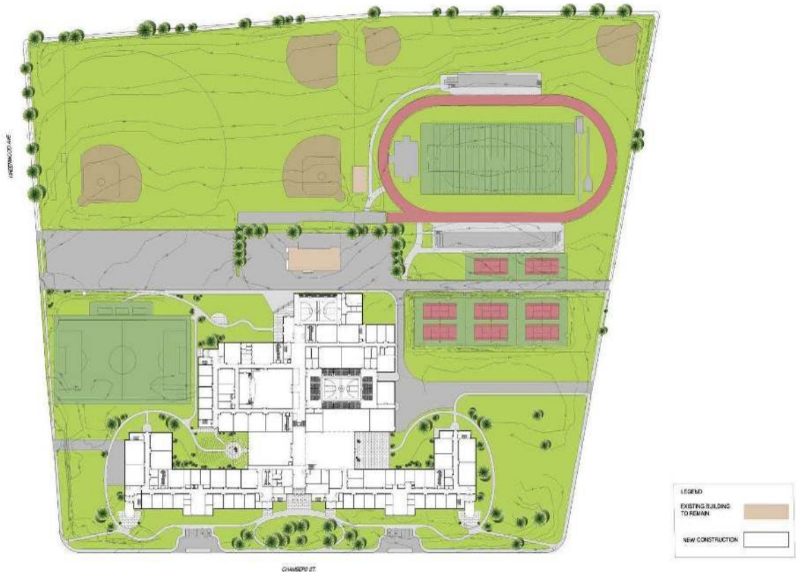
Site plan for the new Trenton Central High School

The SDA will move forward with plans for a new school utilizing a design-build approach. In order to prepare the school site for the construction a new building, the SDA anticipates demolition activities will begin in the spring of 2015.