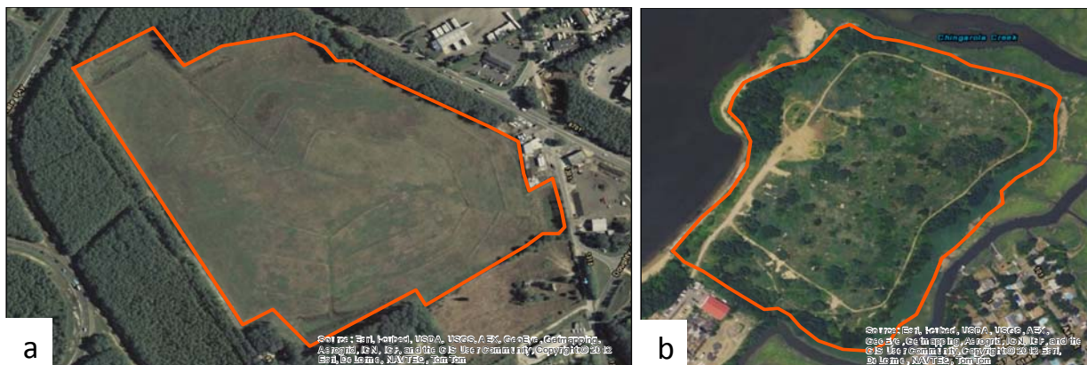
Figure 1. Landfill delineation shapefile polygons (a) Delilah Road Landfill, Atlantic County, (b) Waste Disposal Inc./Aero Marine Landfill, Monmouth County

Once the spatial extent of each landfill was determined, a shapefile was developed in ArcGIS of each delineated landfill. Each parameter included in the database was included in the attributes for each delineated landfill. A digital version of the database is included on a CD-ROM as appendix A.