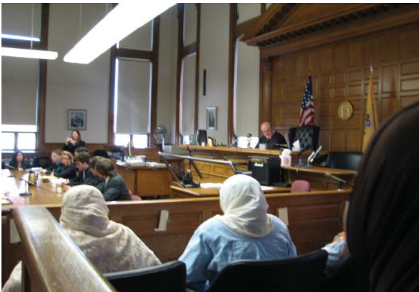
A mock trial is held in a Passaic Vicinage courtroom.