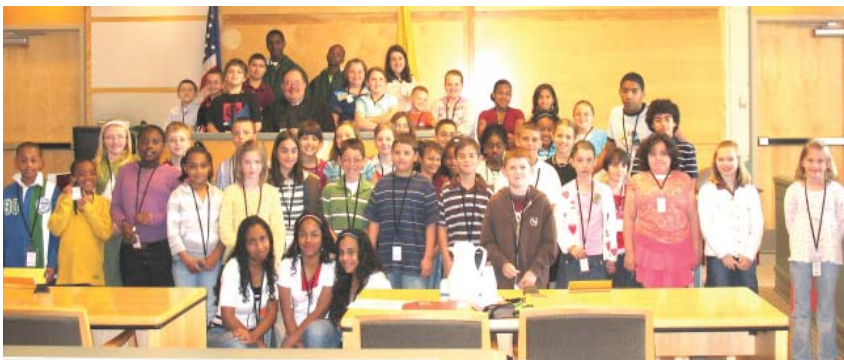
South Jersey's courts welcomed staff children during Take a Child to Work Day in April.

The children enjoyed a mock trial where they participated as co-counsel, witnesses and jurors. The day ended with refreshments and certificates for the children. A good time was had by all.