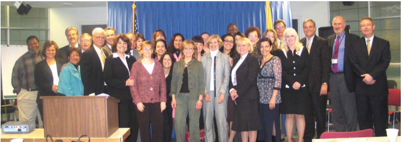
First Trainers' Symposium participants get together during the event this spring.