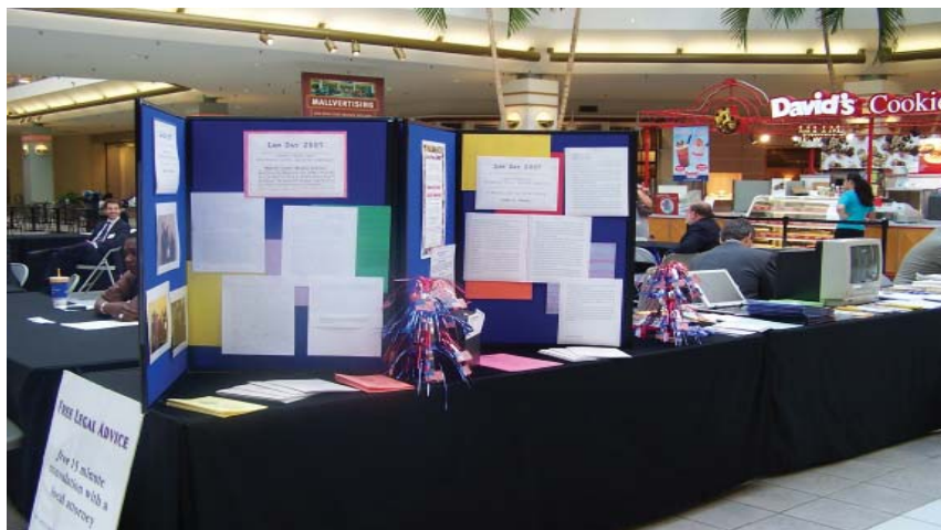
Mercer Vicinage's celebration of Law Day included a colorful exhibit with information and handouts.