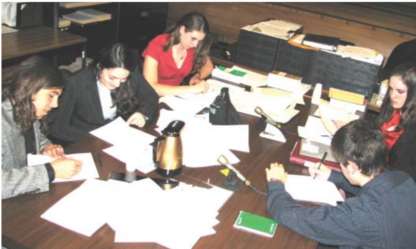
Students from Passaic County prepare for a mock city council session.