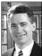
James E. McGreevey James E. McGreevey Governor