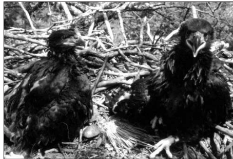
New Jersey eaglets in their nest.

"The bald eagles are impressing us with their population recovery," Clark said. "But given these significant, ongoing impacts, at this point I don't think we're ever going to be able to walk away and say they are recovered."