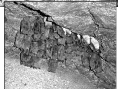
Bats hibernating in Hibernia Mine.