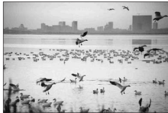
Snow geese at Forsythe refuge.

Whitesbog Village: Between mid-December to mid-March, as many as 500 tundra swans winter in the abandoned cranberry bogs outside of this historic cranberry and blueberry village near Browns Mills in the Pinelands. From NJ Route 70, take County Road 530 west 1.2 miles to village entrance, then follow any of the old bog roads out of the village. Info: Whitesbog Preservation Trust, (609) 893-4646.