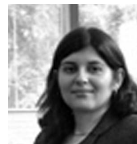
DANIELLE BRADUS Deputy Attorney General