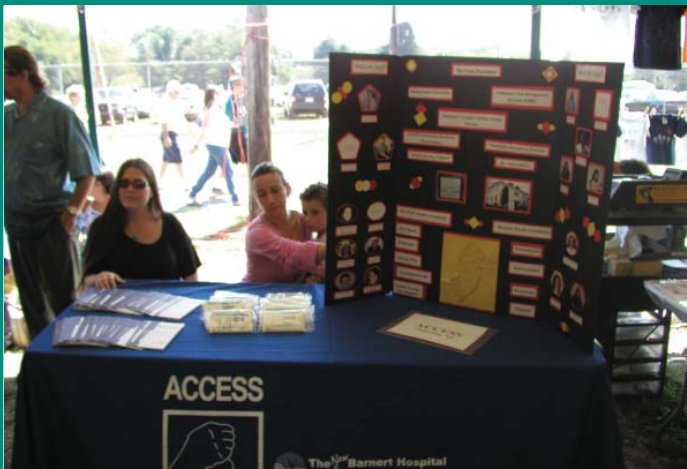
Mental health agency “Access” explains services at their exhibit table.