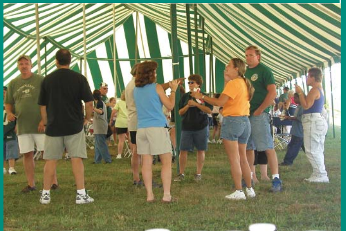
Many spent the day mingling under the tent.