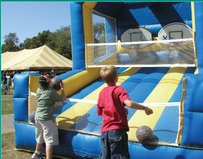
This year's Kiddie Korner was sponsored by NWJAD.

The countdown to Deaf Fest 2007 has now begun.