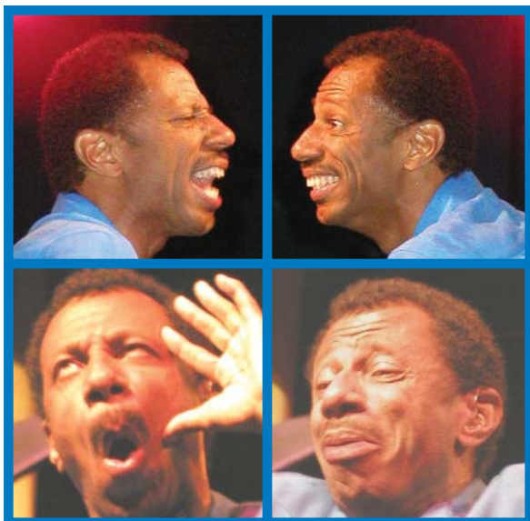
The Faces of CJ