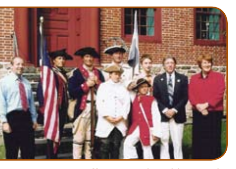
Trust staff pose at the Old Barracks in Trenton with reenactors of the Washington Rochambeau march. The Trust funded an architectural study of this military movement through New Jersey.