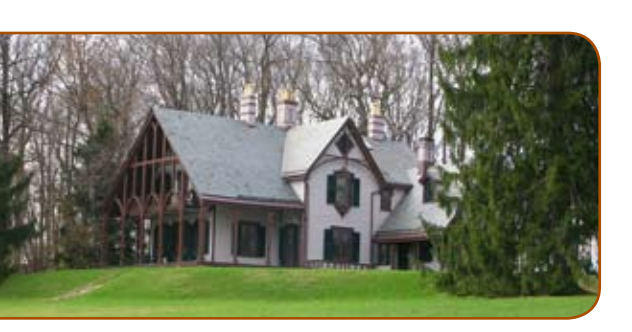
The Willows at Fosterfields Historical Living History Farm in Morristown will be the site of a 40th anniversary reception for the Historic Trust and Historic Sites Council.

The year 2007 will mark the 40th anniversary of the creation of the New Jersey Historic Trust and Historic Sites Council through landmark legislation signed by Governor Richard J. Hughes. The Historic Trust awards matching grants and low-interest loans for historic preservation projects, and the Historic Sites Council advises the State Historic Preservation Officer on possible encroachments to historic resources. Together these agencies have improved public awareness and support for the protection and preservation of valuable New Jersey historic sites for future generations.