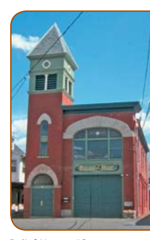
Relief House #2, Raritan Firehouse

Crescent Theater, Sussex in Sussex County, $27,375 and National Register nomination (Grantee: Tri-State Actors Theater)