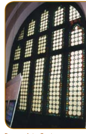
Barron Arts Center, Woodbridge

(Grantee: South Bound Brook Historic Commission)