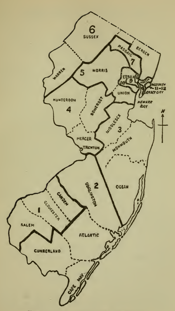
New Jersey Congressional Districts.