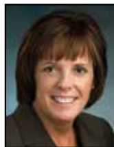
Diane DeBacker Commissioner of Education Kansas Department of Education