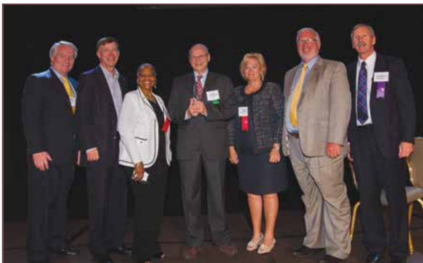
The ECS Executive Committee honored Dr. E. D. Hirsch with the 2012 James Bryant Conant Award at the 2012 ECS National Forum on Education Policy.

Boosting College Completion workshop for 17 legislative education chairs who discussed strategies to use policy to advance higher education goals and learned about new college completion approaches from each other and from experts.