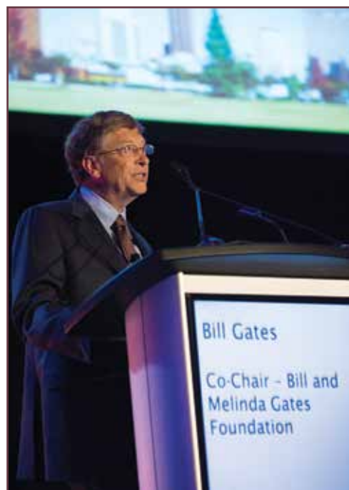
Bill Gates spoke at the 2012 National Forum.