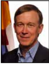
John Hickenlooper Governor State of Colorado