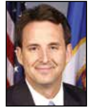
Tim Pawlenty Former Governor State of Minnesota