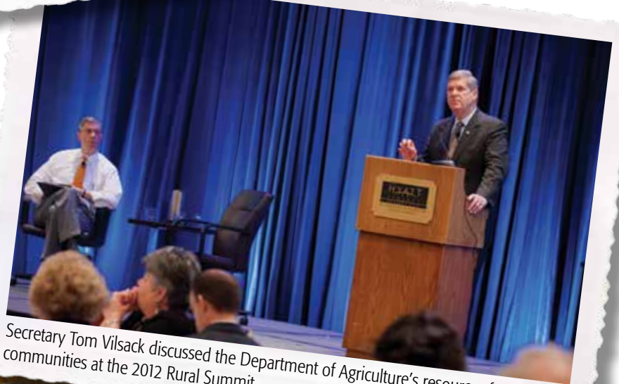
Secretary Tom Vilsack discussed the Department of Agriculture's resources for rural communities at the 2012 Rural Summit.

~Corporate partner commenting on 2012 Rural Summit