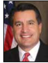
Brian Sandoval Governor State of Nevada