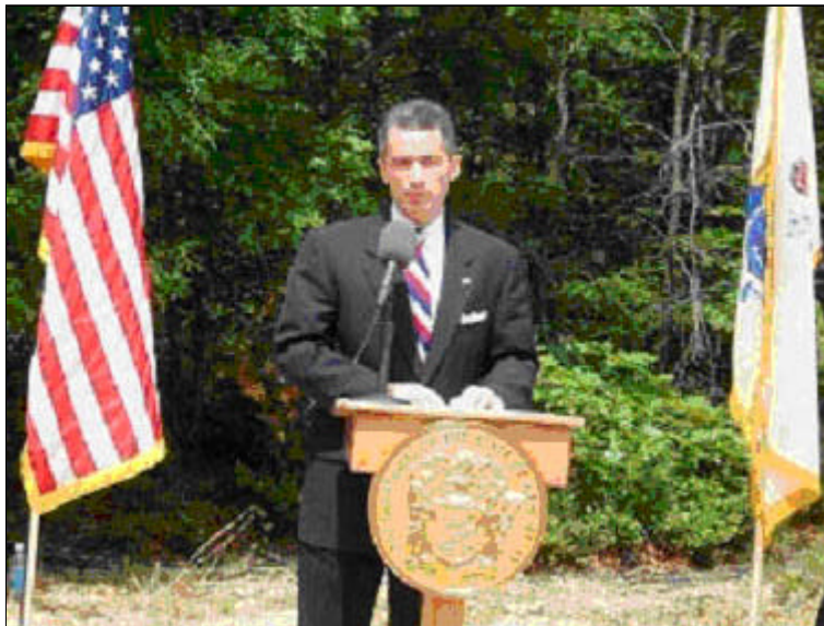
Governor McGreevey at Groundbreaking for New Jackson High School

On June 17th, Governor James McGreevey officiated at a groundbreaking ceremony for a new state-of-the-art high school being built in Jackson Township, Ocean County. The groundbreaking marked a $21.7 million dollar investment by the State through the SCC to support the creation of a $70 million new school facility that will accommodate 1,900 high school children.