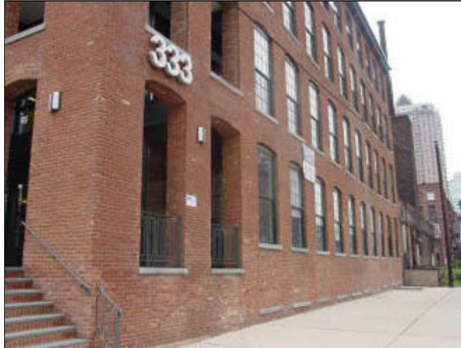
SCC Hudson County Regional Office

The SCC held an open house at the new Hudson County Regional Office on June 11th. The clear goal of the office is to help facilitate building of schools for managed projects in that region's districts. This was the first of several openings that will take place in the coming months. The SCC is strategically siting the regional offices in areas where the bulk of the work will be done. Each of these offices will be purposely placed to ensure individual school districts are better served.