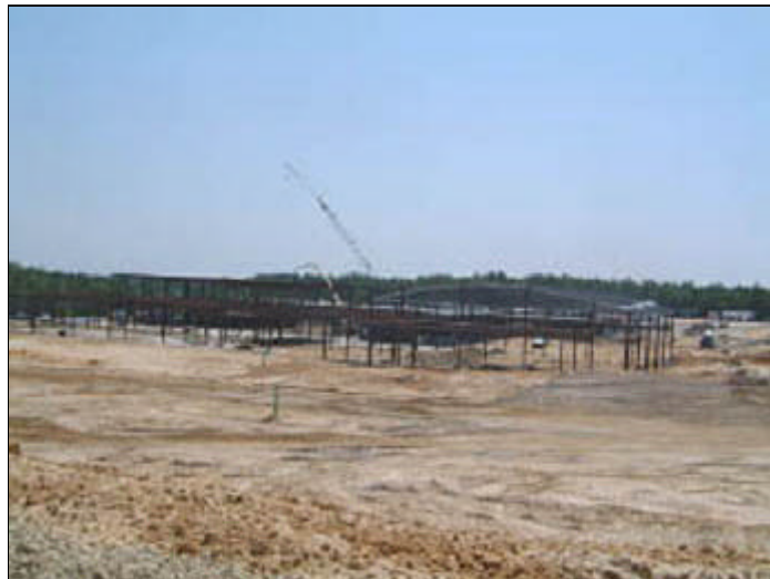
View of New Barnegat High School from Athletic Fields

The 156,400 square foot, two story school will accommodate over 1,000 students and will be built on a site off Rose Hill Road. The state provided over $21 million to fund the $31 million new high school. The facility will include 29 classrooms, six science labs, two technology labs, cafeteria/kitchen, media center, guidance administration offices, gymnasium auxiliary gym, locker rooms, auditorium, art and music rooms. Outside the school are fields for football, softball and baseball, as well as a track and tennis courts.