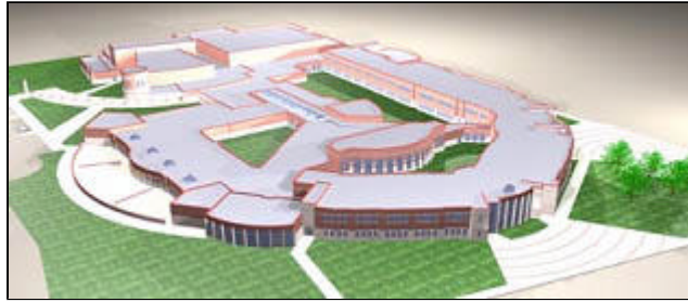
Architectural Rendering of the New Jackson High School

The project itself involves new construction of a 288,500 square-foot facility with three wings, each designed with an open-air courtyard. The school will have 50 classrooms on the ground floor with an additional 35 classrooms in the west wing. Also included will be a media center, athletic fields, an 1,800 seat gymnasium, weight room, wrestling room, and an auditorium, as well as an art studio with an outside working area.