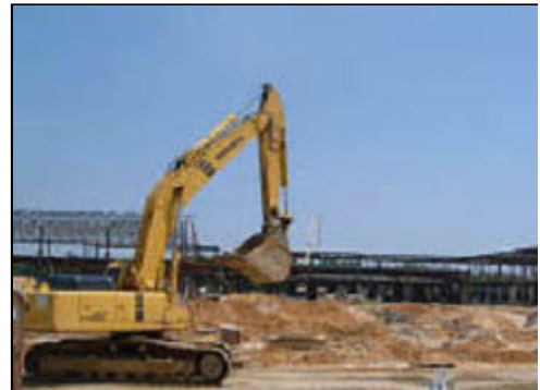
Construction Progress at New Barnegat High

Beyond the new facility's steel framework coming to completion, other work that has been finished up to this point includes site work for the school building, athletic fields, and parking areas being roughed out. The underground plumbing and drainage for the building has also been completed. Additionally, installation of the building's ductwork and concrete block is well underway and a concrete slab has been poured for the high school's 2nd floor.