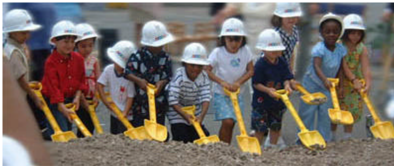
Children from the Elizabeth School District Participate in Groundbreaking

The Elizabeth School District also celebrated a groundbreaking for a new Early Childhood Center for which the State will fully fund by providing over $12 million. On June 10th, SCC staffers were on hand while local, other state and school district officials officiated. The new educational facility will include over 20 pre-kindergarten classrooms that will house upwards of 300 three and four year-olds.