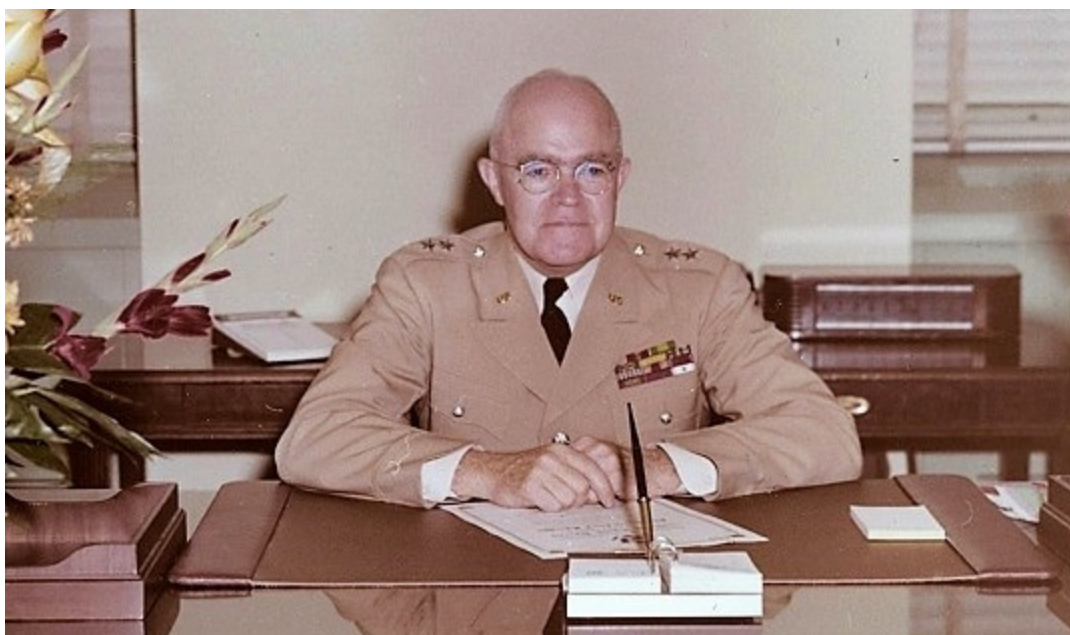
General Donald McGowan