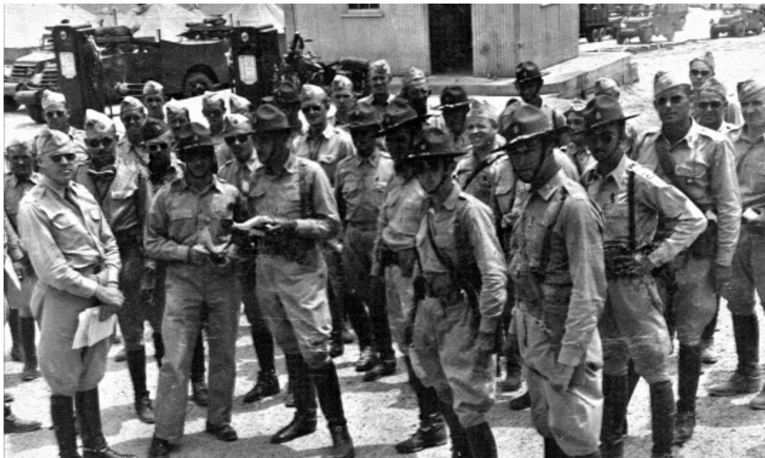
Officers of the 102nd Cavalry at Fort Jackson, South Carolina. The 102nd Cavalry of the New Jersey National Guard was called to active duty and