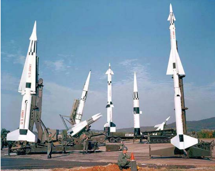
Nike missile family on display at Redstone Arsenal, Ala., circa, 1960s. From left, MIM-14 Nike Hercules, MIM-23 Hawk (front), MGM-29 Sergeant (back), LIM-49 Spartan, MGM-31 Pershing, MGM-18 Lacrosse, MIM-3 Nike Ajax.

In commemoration of the 40th anniversary of the Air Defense Artillery deactivation, the 2014 ADA Reunion Picnic/Luncheon will be held Sept. 5, 2014, at the National Guard Training Center at Sea Girt, N.J.