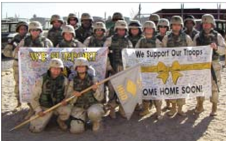
50th Finance Battalion in front of Central Funding in Iraq.