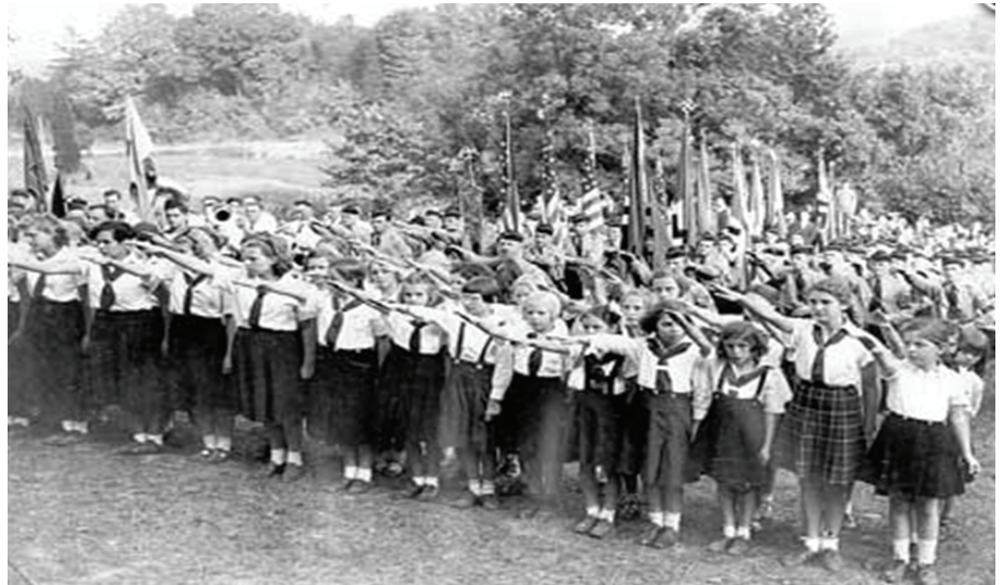
These young girls appear in their official German-American Bund uniform and stand in formation at Camp Nordland in 1938.