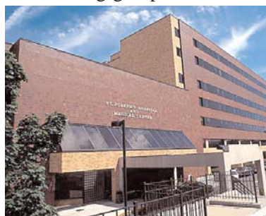
St. Joseph's Regional Medical Center (1) low

Even though the financial position of St. Joseph's has improved over the last few years, the rating agencies remained cautious, with Moody's and Standard & Poor's rating the bonds "Ba1" and "BBB-", respectively. The working group, therefore, had to overcome two large hurdles in order to achieve a low cost financing for St. Joseph's: