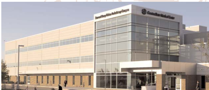
CentraState Ambulatory Care Center, completed with the proceeds of auction rate bonds issued in 2006, converted in 2008

Within that transaction, Series 2006B bonds in the amount of $29,850,000 were issued as taxable auction rate bonds, insured by Assured Guaranty. The transaction's bond documents included language that allowed for a conversion, and following the collapse of the auction rate market, CentraState decided to convert all of the Series 2006B bonds.