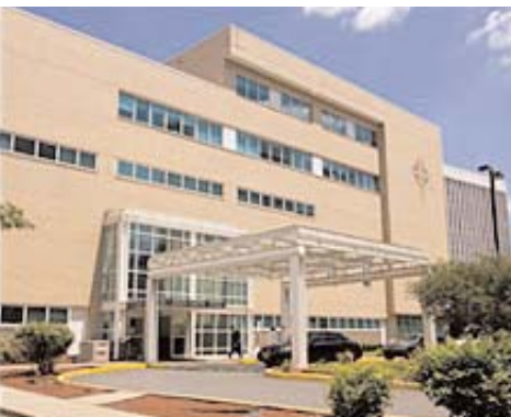
St. Michael's Medical Center

Consistent with the HATP, the proceeds of the St. Michael's issues were used to pay off outstanding debt and