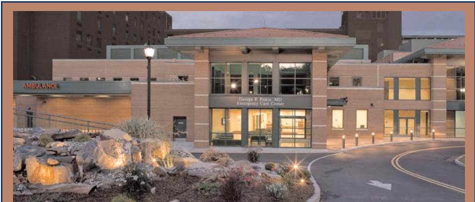
Holy Name Hospital's new emergency care center

The facility cost $22 million to complete; the remainder of the 2006 issue was used to currently refund two of the Authority's outstanding COMP Series (1998 and 2001), and to refinance capitalized leases. The official ribbon-cutting ceremony for the facility was held on September 18, 2008. §