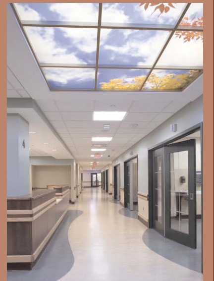
New center's interior main hallway