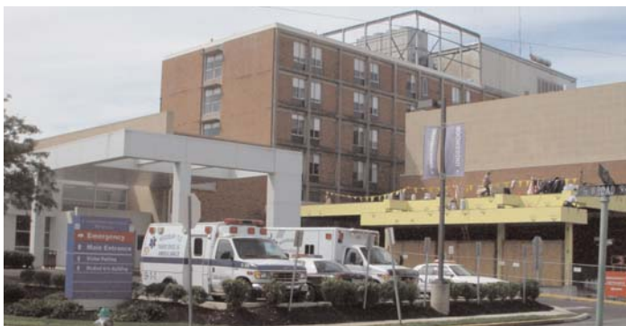
Underwood-Memorial Hospital expansion project funded by auction rate bonds issued in 2004, refunded in 2008

The Bank of New York is the Bond Trustee.