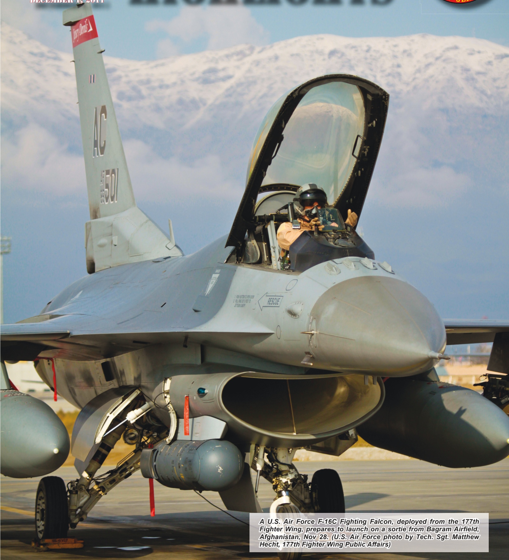
A U.S. Air Force F-16C Fighting Falcon, deployed from the 177th Fighter Wing, prepares to launch on a sortie from Bagram Airfield, Afghanistan, Nov 28.