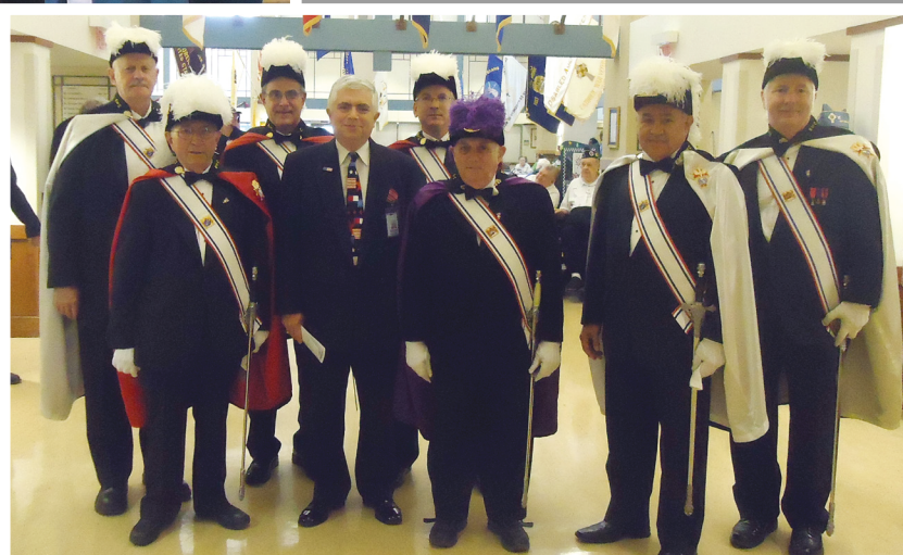
Photo right: The Knights of Columbus visited residents of the Menlo Park home Nov. 20, during the Vietnam Veterans of America #223 "Celebration of Our Veterans" program.