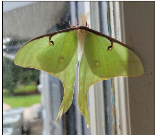
Above: Staff shared 43 photos on Instagram in August 2021, including this photo of a Luna moth that visited the Fenwick Manor farmhouse.