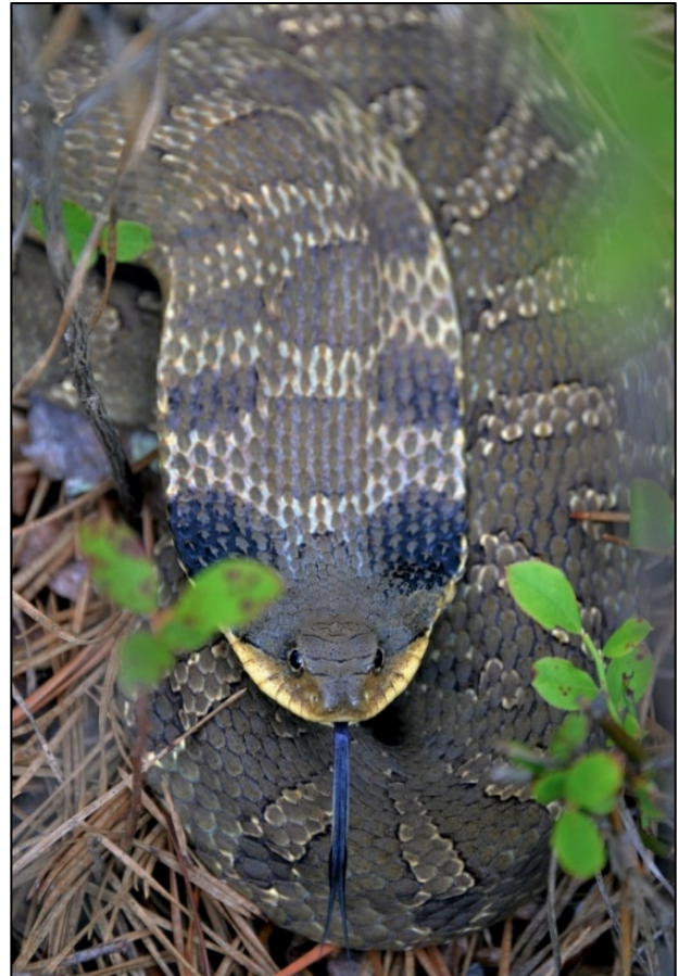
Above: The eastern hognose snake often flattens its neck like a cobra and hisses to ward off potential threats.