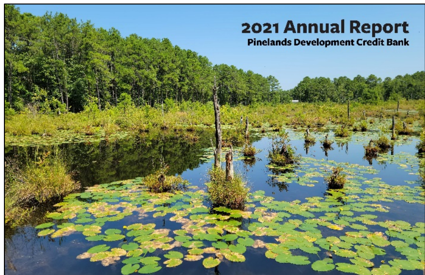
Above: The cover of the Pinelands Development Credit Bank’s 2021 Annual Report.