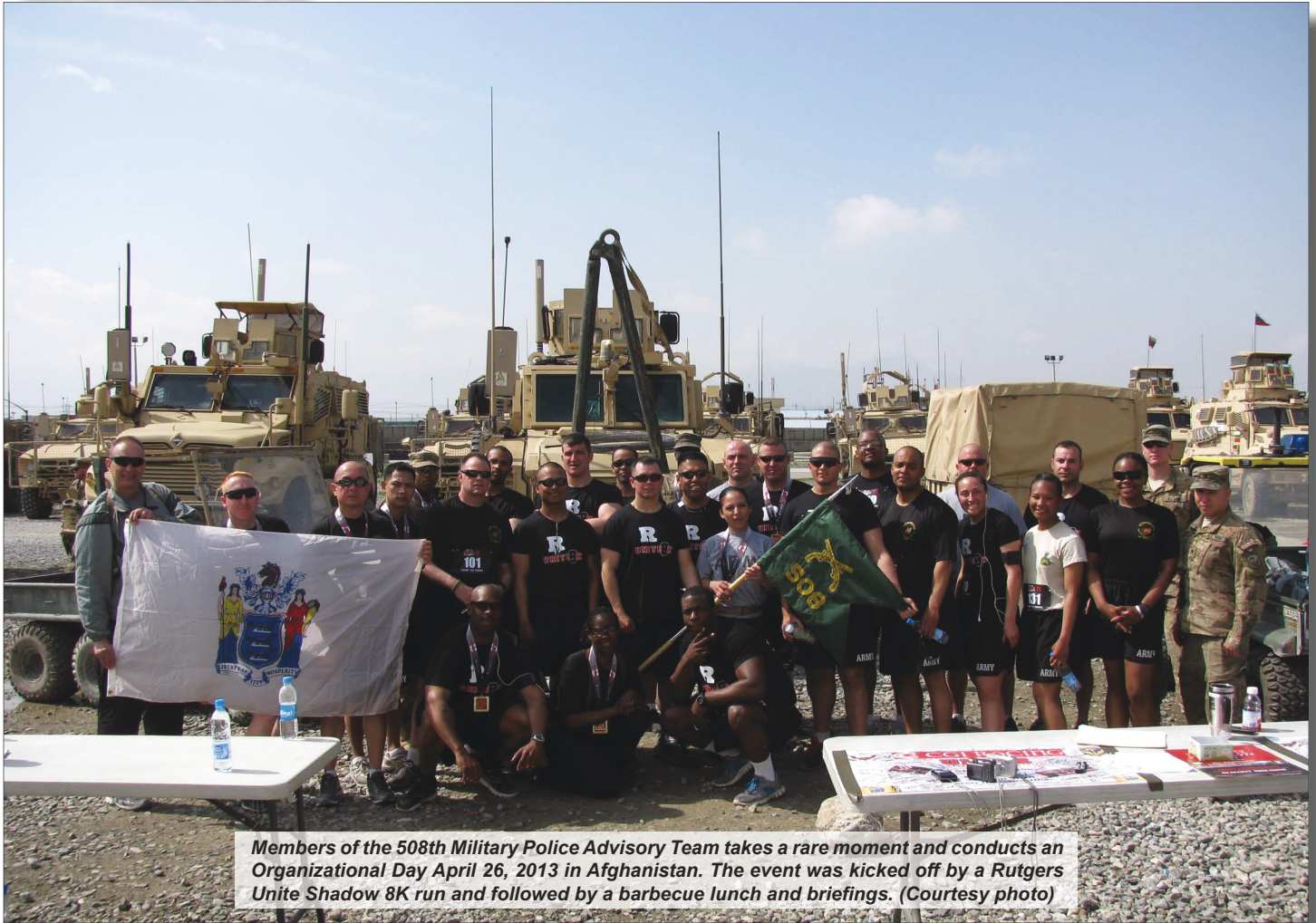
Members of the 508th Military Police Advisory Team takes a rare moment and conducts an Organizational Day April 26, 2013 in Afghanistan. The event was kicked off by a Rutgers Unite Shadow 8K run and followed by a barbecue lunch and briefings.