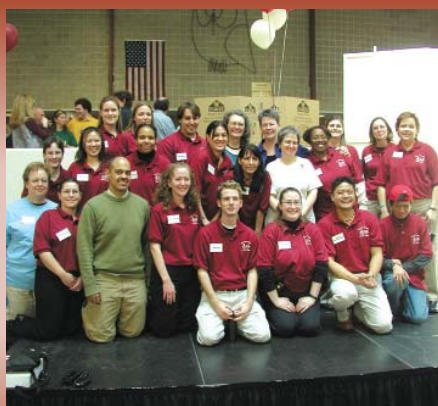
UCC Students and Staff looking quite relieved after a great day of work!