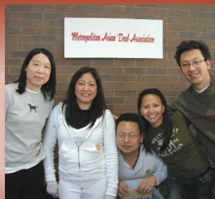
MADA takes a break from their booth to pose for the camera.