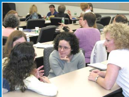
A workshop breakout group discusses elements of prosody in their signed utterances.