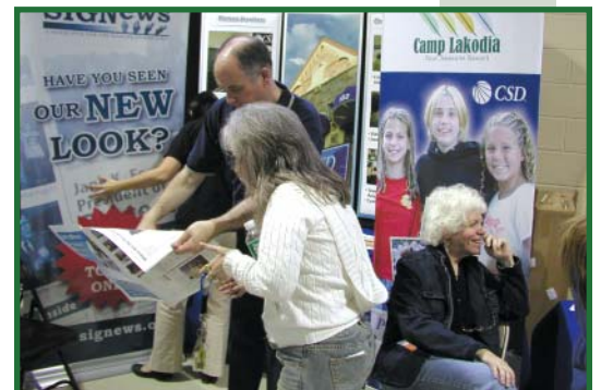
Communication Service for the Deaf promotes its SIGNews newspaper.