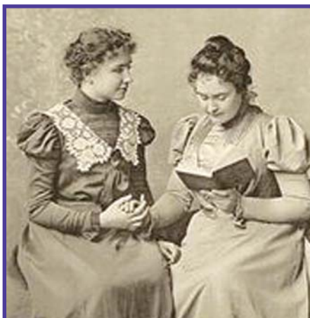
Helen Keller (left) listens with her hands while teacher and life long companion Anne Sullivan reads to her.

Helen Keller was born in Tuscumbia, Alabama, on June 27, 1880. At nineteen months of age she came down with an illness described by doctors as "an acute congestion of the stomach and the brain," which could have possibly been scarlet fever or meningitis. The illness left her Deaf and blind. By age seven, she had invented over sixty different signs that she could use to communicate with her family. Keller's parents contacted the Perkins Institute for the Blind, where the school delegated teacher and former student, Anne Sullivan, herself visually impaired, to be Keller's teacher. It was the beginning of a 49-year-long relationship. Anne was able to teach Helen to speak using the Tadoma method (touching the lips and throat of a speaker in order to understand what is being said) combined with fingerspelling alphabetical characters on the palm of Helen's hand. Later, Keller would also learn to read English, French, German, Greek, and Latin in Braille. Keller devoted much of her later life to raise funds for the American Foundation for the Blind. She died on June 1, 1968, passing away 26 days before her 88th birthday, in her Easton, Connecticut home. In 2003, the state of Alabama honored Keller, a native of the state, on its state quarter.