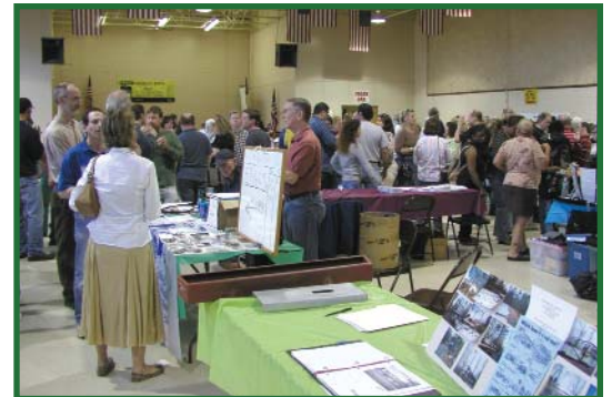
Consumers enjoying the New Jersey Deaf Exposition.