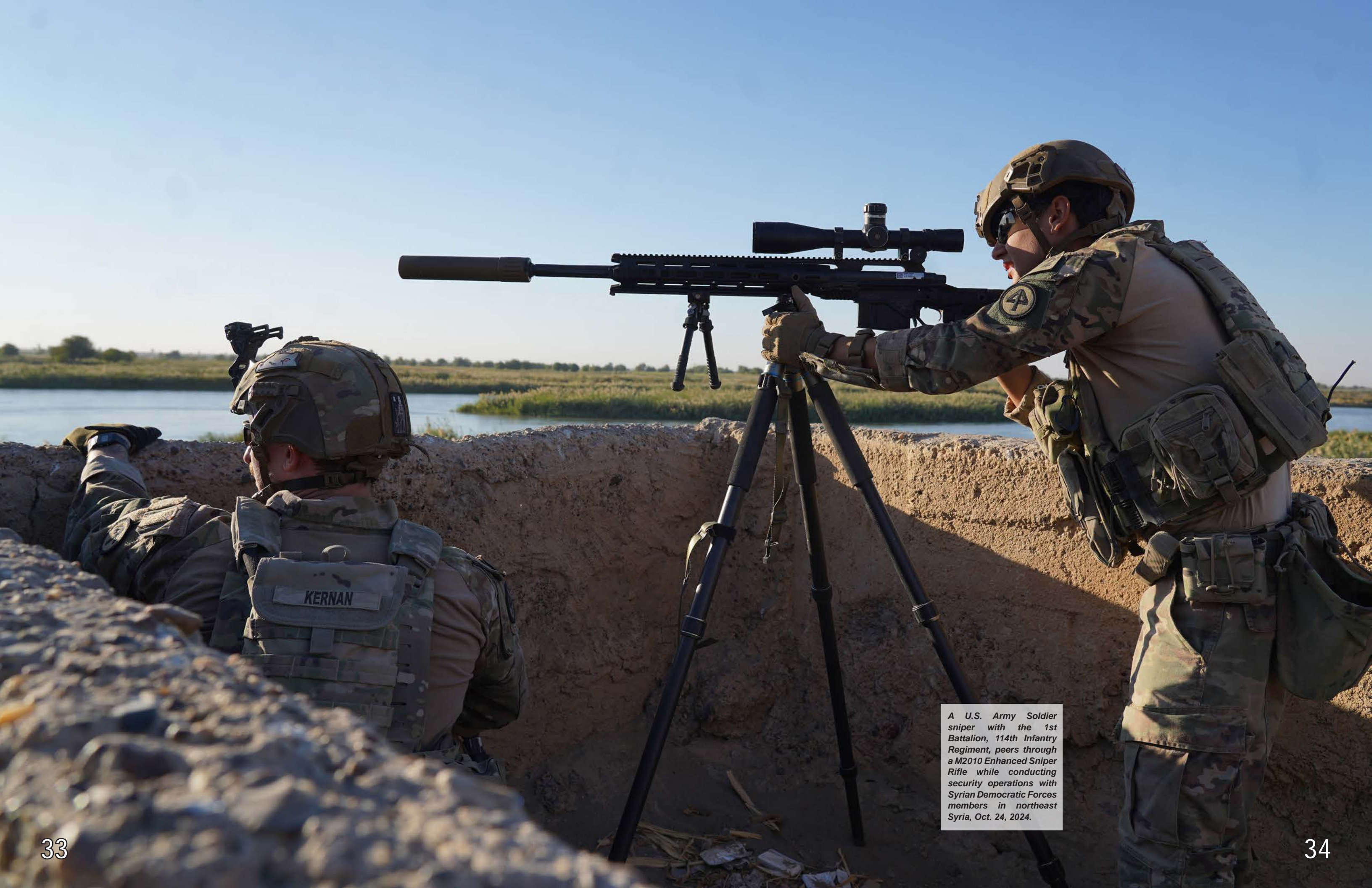
A U.S. Army Soldier sniper with the 1st Battalion, 114th Infantry Regiment, peers through a M2010 Enhanced Sniper Rifle while conducting security operations with Syrian Democratic Forces members in northeast Syria, Oct. 24, 2024.