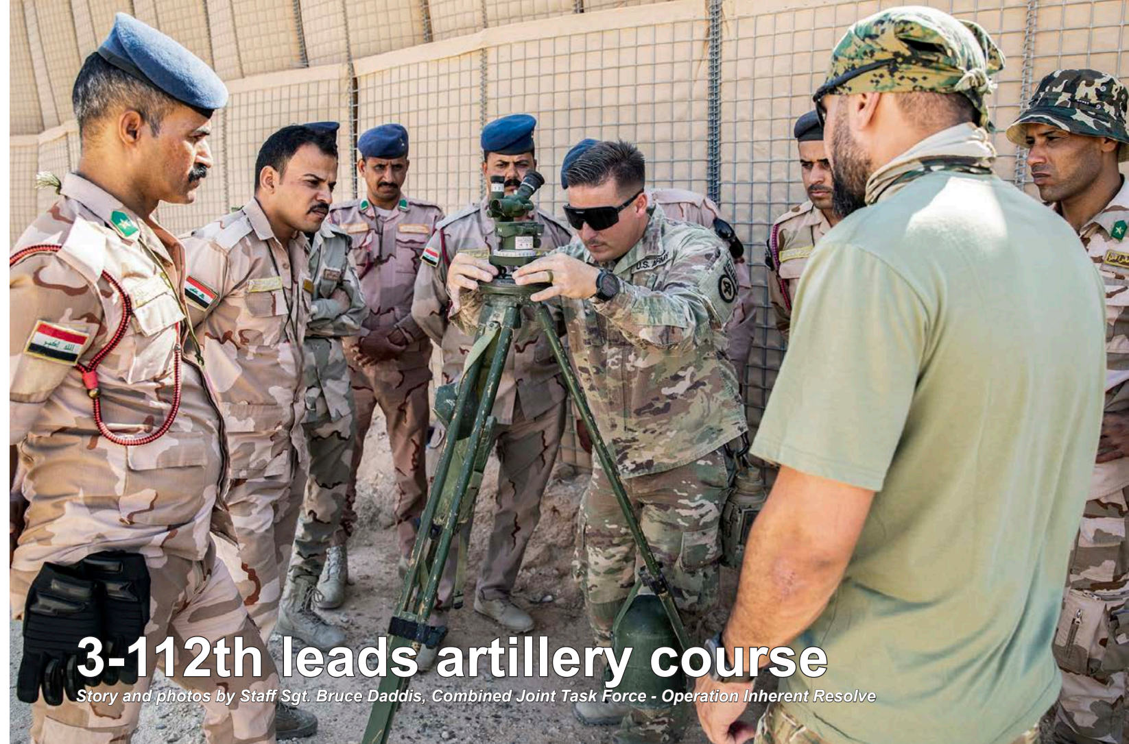
Combined Joint Task Force - Operation Inherent Resolve.