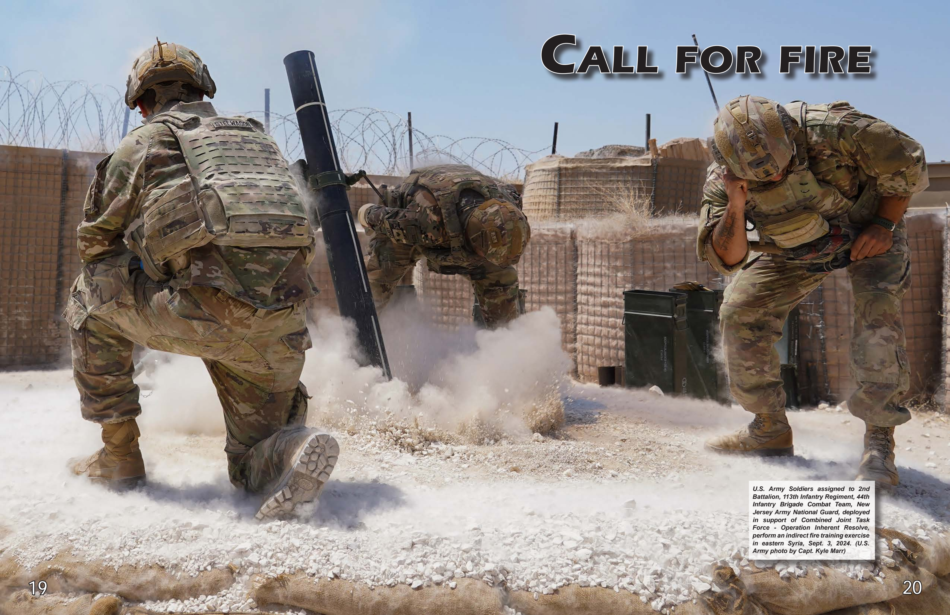
U.S. Army Soldiers assigned to 2nd Battalion, 113th Infantry Regiment, 44th Infantry Brigade Combat Team, New Jersey Army National Guard, deployed in support of Combined Joint Task Force - Operation Inherent Resolve, perform an indirect fire training exercise in eastern Syria, Sept. 3, 2024.