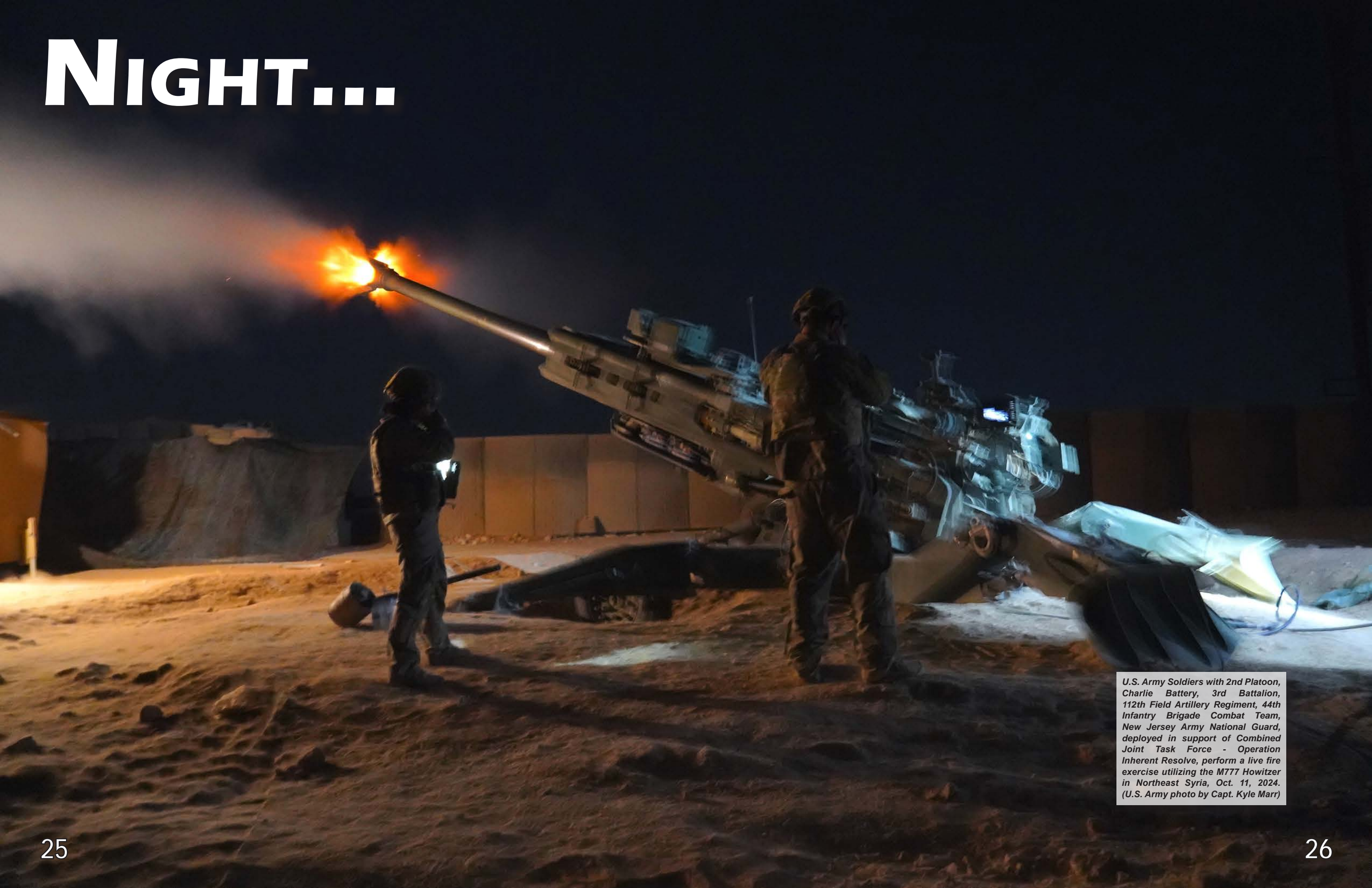
U.S. Army Soldiers with 2nd Platoon, Charlie Battery, 3rd Battalion, 112th Field Artillery Regiment, 44th Infantry Brigade Combat Team, New Jersey Army National Guard, deployed in support of Combined Joint Task Force - Operation Inherent Resolve, perform a live fire exercise utilizing the M777 Howitzer in Northeast Syria, Oct. 11, 2024.