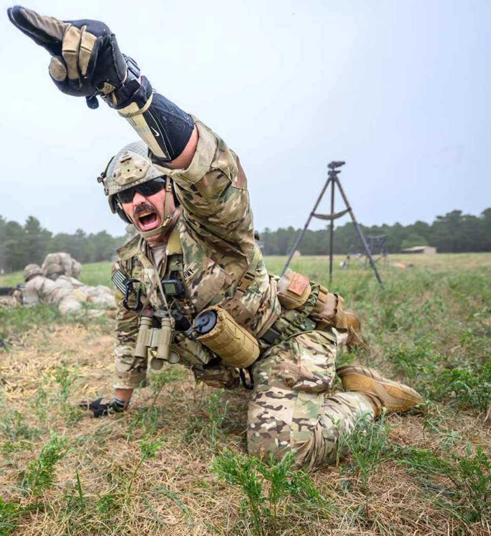
Above: U.S. Army Soldiers from Active Duty, National Guard, and Reserve forces participate in live-fire battle drills during the 254th Regiment (Combat Arms) Infantry Advanced Leaders Course at Joint Base McGuire-Dix-Lakehurst, New Jersey, July 25, 2024. Advanced Leaders Course is a branch-specific course that provides Soldiers selected for promotion to Staff Sgt. an opportunity to enhance leadership, technical skill, tactical expertise, and experience needed to lead squad-size units.