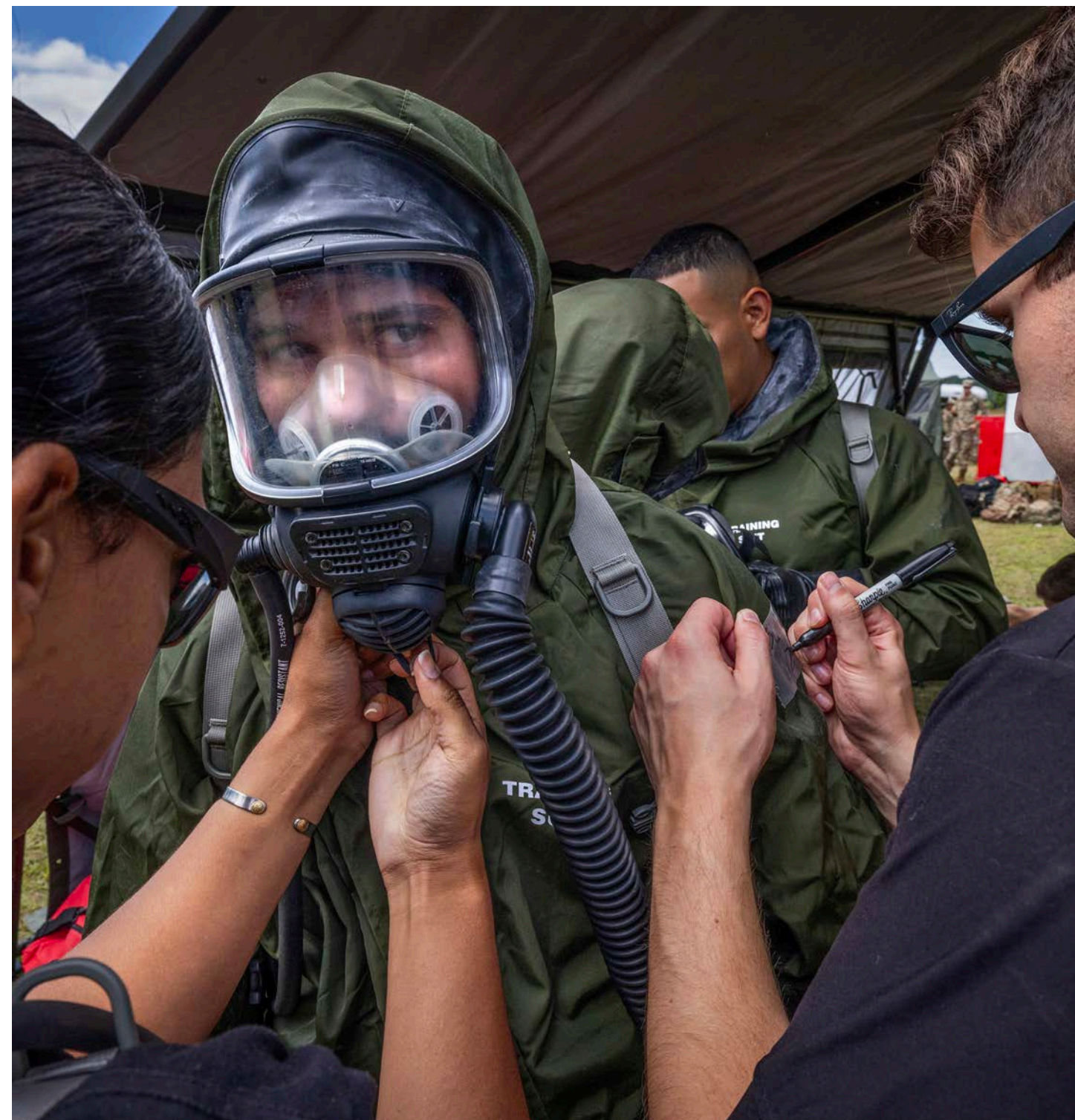
A U.S. Army Soldier with the 328th Military Police Company, New Jersey Army National Guard, has his Level C suit checked during Vigilant Guard 24 – NJ at the New Jersey Task Force 1 Training Facility at Joint Base McGuire-Dix-Lakehurst, New Jersey, Aug. 20, 2024. Vigilant Guard is an interagency emergency preparedness exercise which evaluates and enhances the integration of local, state, and federal responders while improving coordination for relief efforts, response and recovery management plans, and operational relationships.