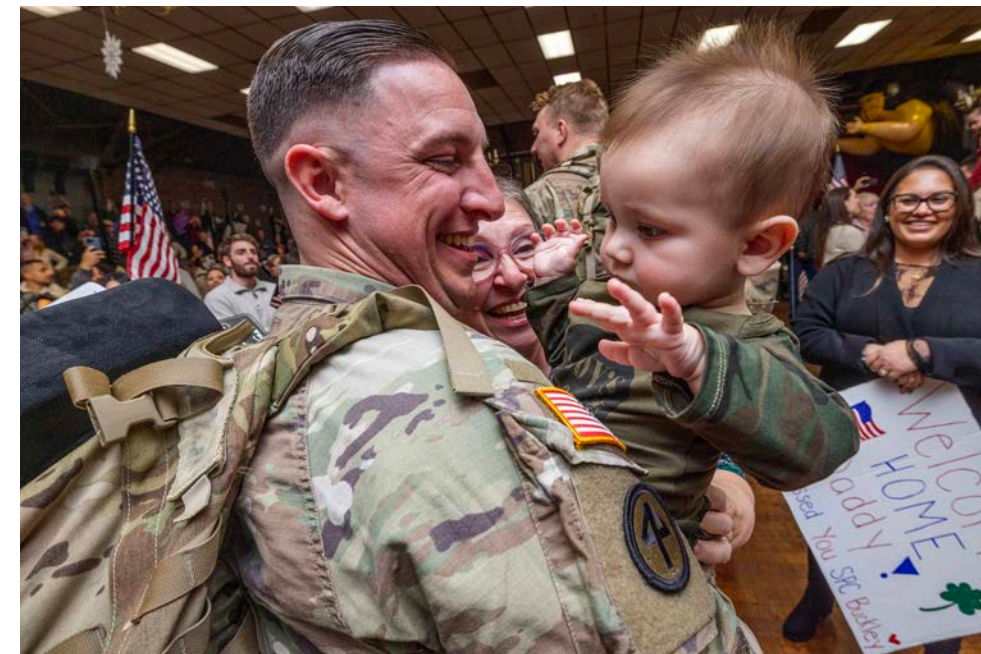
Below: Family members and friends welcome home more than 240 U.S. Army Soldiers with the 44th IBCT in time for the holidays at the National Guard Armory in Lawrenceville, New Jersey, Dec. 20, 2024.