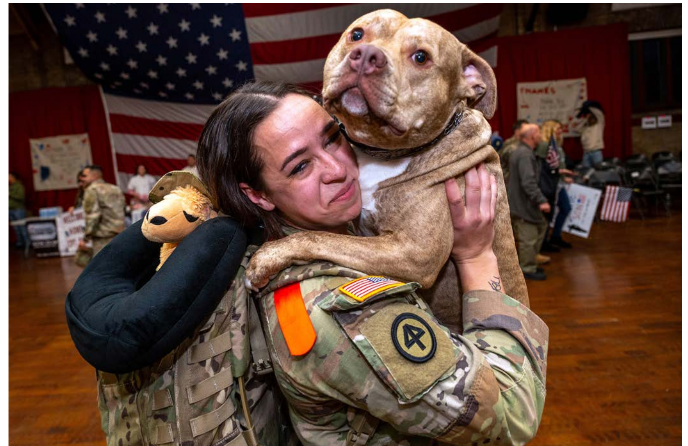
Above: More than 100 U.S. Army Soldiers with the 44th IBCT are welcomed home in Lawrenceville, New Jersey, Dec. 14, 2024.