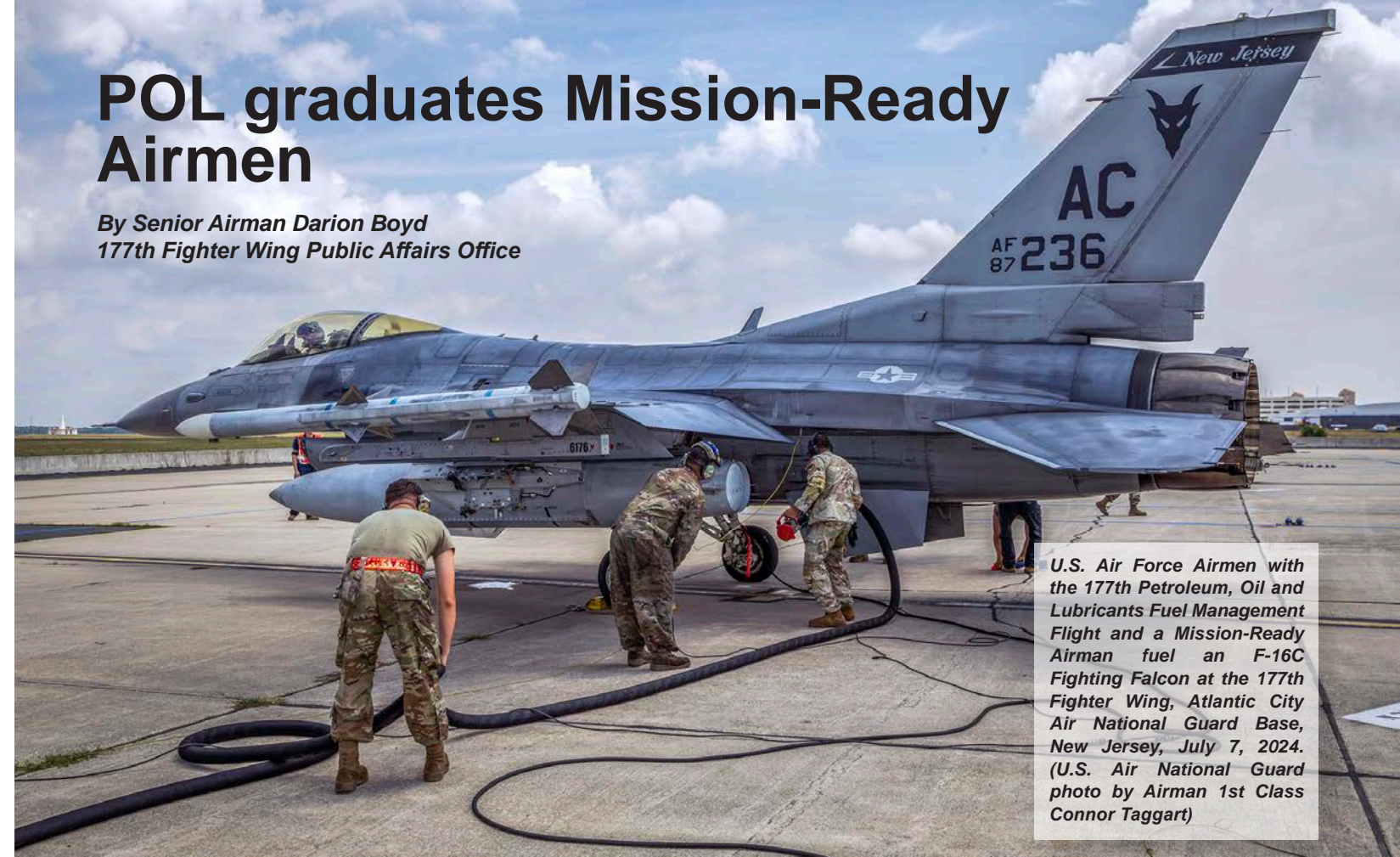
U.S. Air Force Airmen with the 177th Petroleum, Oil and Lubricants Fuel Management Flight and a Mission-Ready Airman fuel an F-16C Fighting Falcon at the 177th Fighter Wing, Atlantic City Air National Guard Base, New Jersey, July 7, 2024.

By Senior Airman Darion Boyd 177th Fighter Wing Public Affairs Office