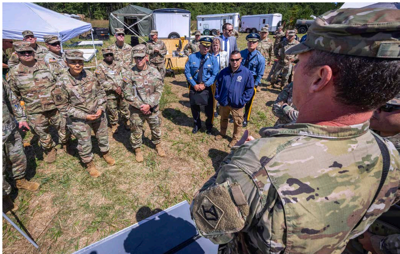
Below: New Jersey National Guard leadership; U.S. Northern Command; North American Aerospace Defense Command; Federal Emergency Management Agency; New Jersey State Police, and the New Jersey Office of Homeland Security and Preparedness observe Vigilant Guard 24 – NJ operations Aug. 20, 2024.