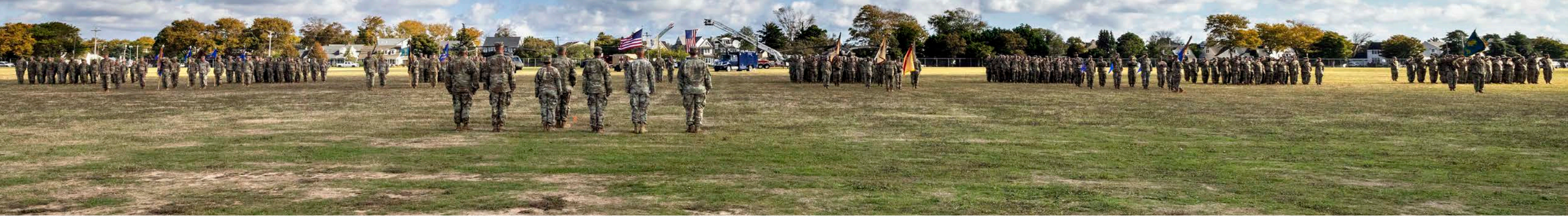
Above: View of the parade field during the 2024 New Jersey National Guard Military Review at the National Guard Training Center in Sea Girt, New Jersey, Oct. 6, 2024. The Military Review is a more than