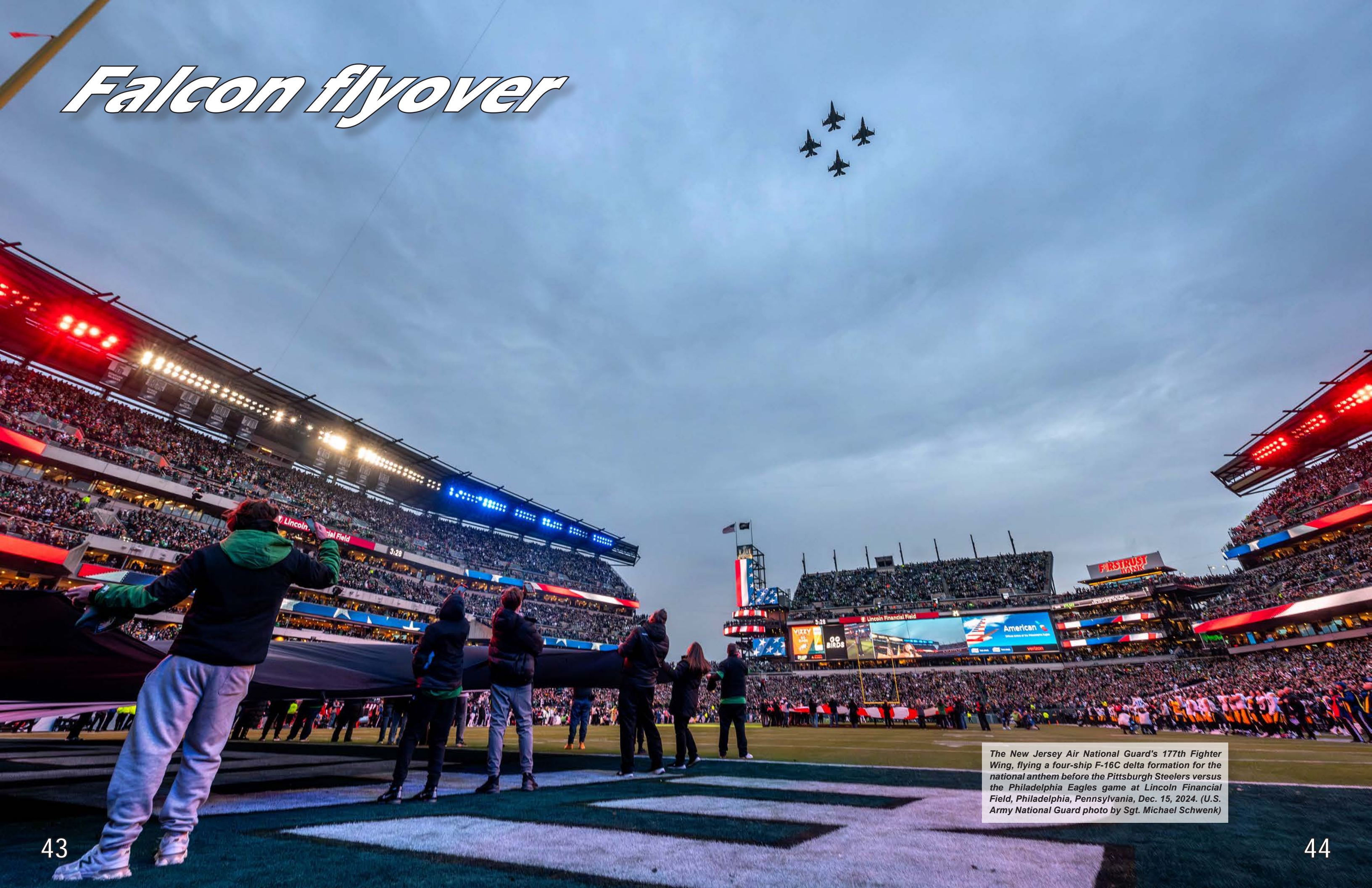
The New Jersey Air National Guard's 177th Fighter Wing, flying a four-ship F-16C delta formation for the national anthem before the Pittsburgh Steelers versus the Philadelphia Eagles game at Lincoln Financial Field, Philadelphia, Pennsylvania, Dec. 15, 2024.