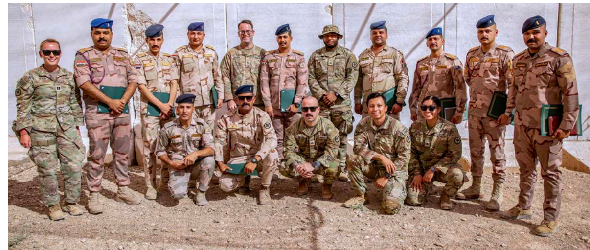
U.S. Army Soldiers with the 3rd Battalion, 112th Field Artillery Regiment, and Iraqi Division of Artillery's 1st Brigade soldiers have their photo taken after completing the Task Force Redleg Artillery Course in western Iraq, Aug. 1, 2024.