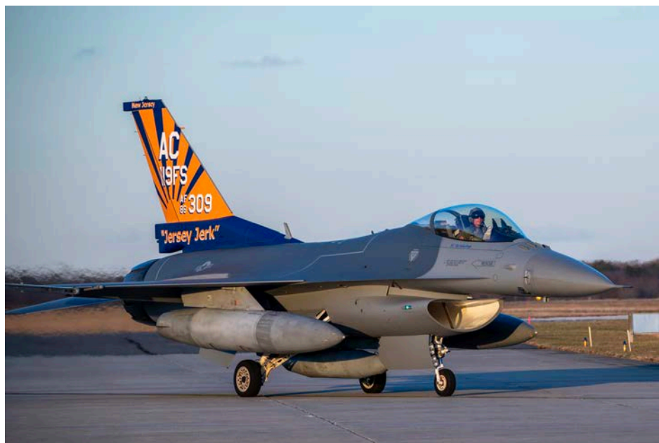
A U.S. Air Force F-16C Fighting Falcon with the 119th Fighter Squadron taxis while bearing the new “Jersey Jerk” flagship tail flash on the flightline at the 177th Fighter Wing, New Jersey Air National Guard, Atlantic City Air National Guard Base, New Jersey, Dec. 5, 2024. The aircraft is dedicated to U.S. Air Force Maj. Gen. Donald Strait, a retired NJANG commander who flew a P-47 Thunderbolt and a P-51 Mustang of the same name.

Strait originally wanted the plane’s name to reflect the state where he grew up.