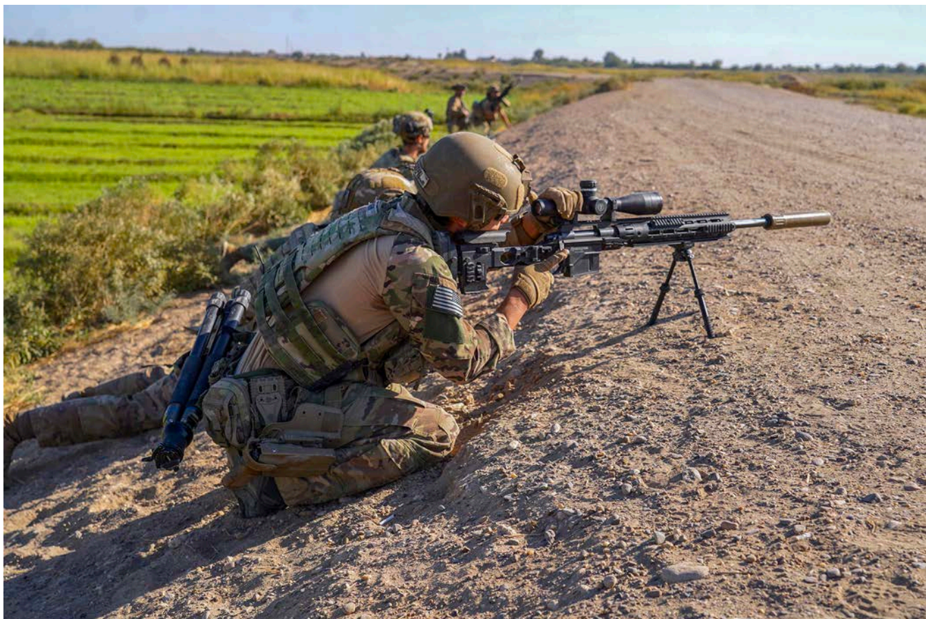
Below: A U.S. Army Soldier sniper with the 1st Battalion, 114th Infantry Regiment, peers through a M2010 Enhanced Sniper Rifle provides cover while on patrol with Syrian Democratic Forces.