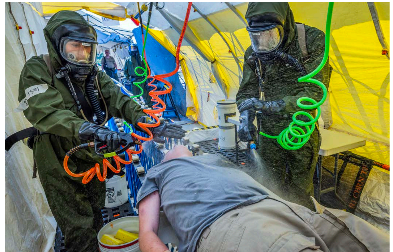
Below: U.S. Army National Guard Soldiers with the Massachusetts CBRN Task Force decontaminate a simulated casualty at the New Jersey Task Force 1 Training Facility at Joint Base McGuire-Dix-Lakehurst, New Jersey, Aug. 20, 2024.