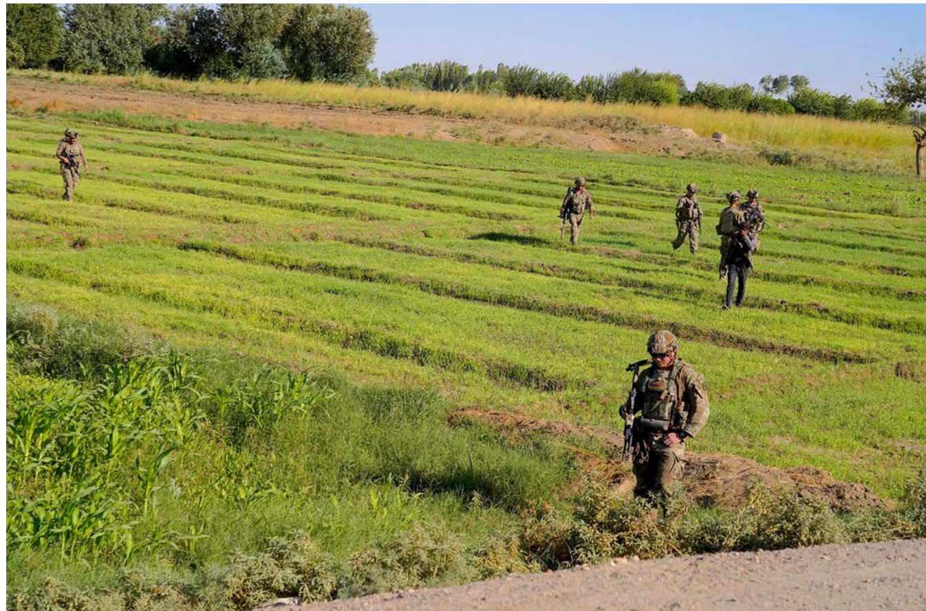
Above: U.S. Army Soldiers with the 1st Battalion, 114th Infantry Regiment, cross a field while on foot patrol in northeast Syria, Oct. 24, 2024.