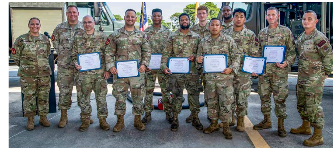
U.S. Air Force Airmen with the 177th Fighter Wing, New Jersey Air National Guard, have their photo taken after completing the petroleum, oil and lubricants Multi-Capable Airman course at the Atlantic City Air National Guard Base, New Jersey, Aug. 8, 2024. The MCA training course takes Airmen from different career fields and trains them to become efficient in POL competencies such as R-11 operation maintenance, cryogenic operations, fuel laboratory center operations and basic fuel service center operations.