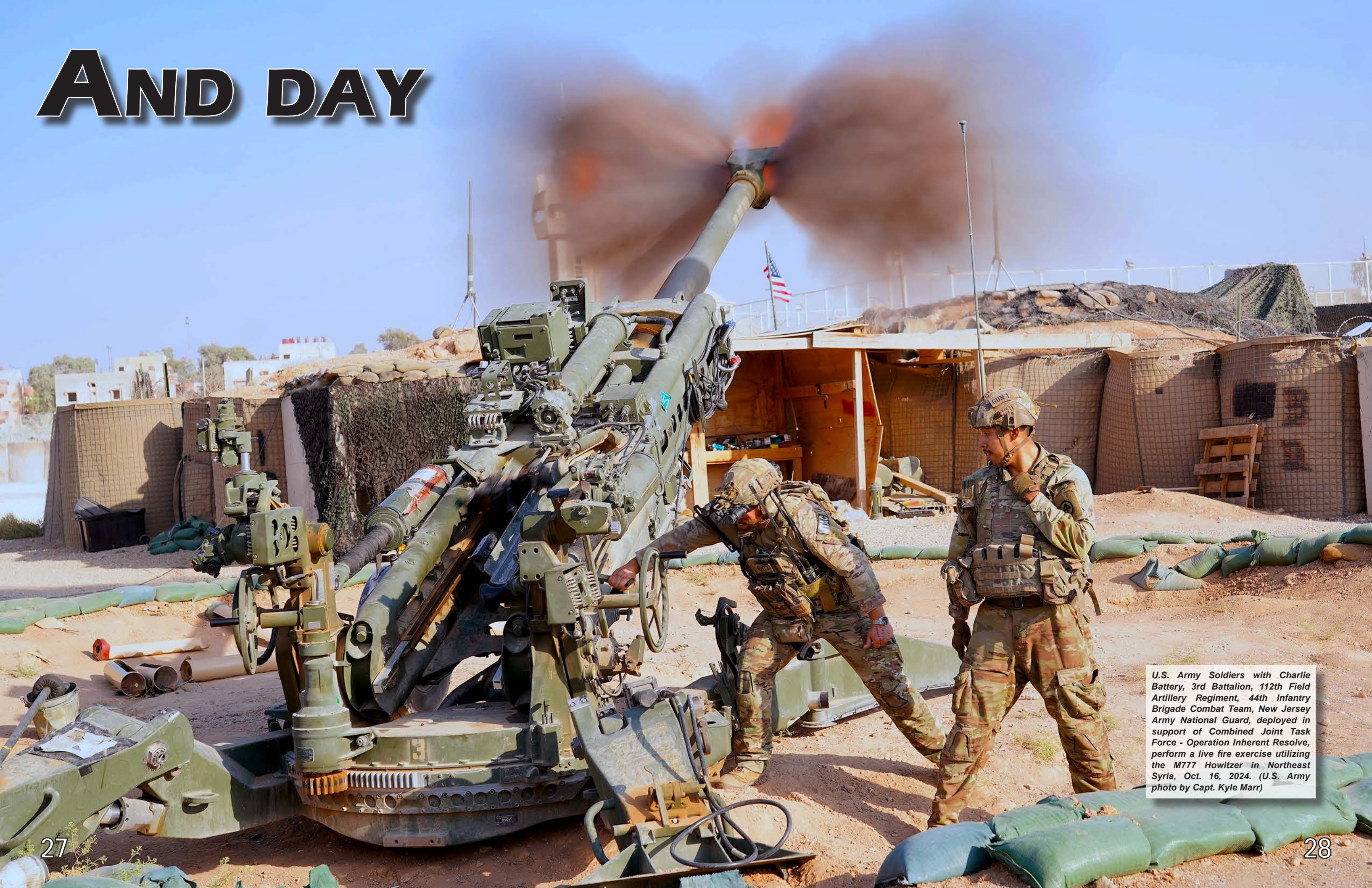
U.S. Army Soldiers with Charlie Battery, 3rd Battalion, 112th Field Artillery Regiment, 44th Infantry Brigade Combat Team, New Jersey Army National Guard, deployed in support of Combined Joint Task Force - Operation Inherent Resolve, perform a live fire exercise utilizing the M777 Howitzer in Northeast Syria, Oct. 16, 2024.