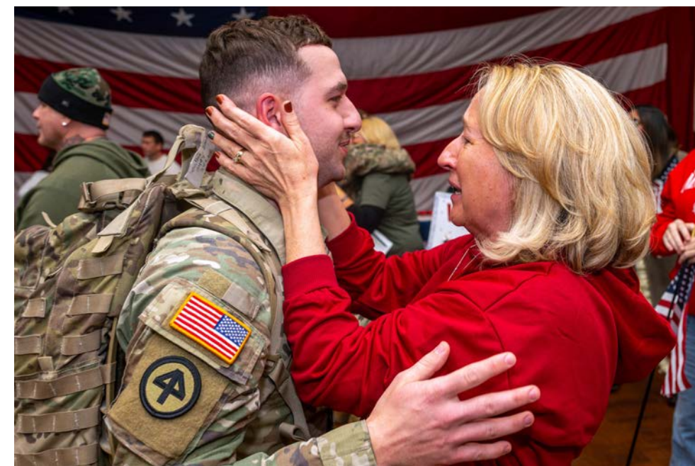
Above: More than 100 U.S. Army Soldiers with the 44th Infantry Brigade Combat Team, New Jersey Army National Guard, are welcomed home by family members and friends at the National Guard Armory in Lawrenceville, New Jersey, Dec. 14, 2024. Over 1,500 44th IBCT Soldiers deployed to Iraq, Kuwait, and Syria in support of Operation Inherent Resolve, the largest deployment of NJARNG Soldiers since 2008.

Combined Joint Task Force-Operation Inherent Resolve is dedicated to the defeat of the Islamic State in Iraq and Syria and the advising, assisting and enabling of the Iraqi Security Forces, Syrian Democratic Forces and Syrian Free Army within the United States Central command area of responsibility.