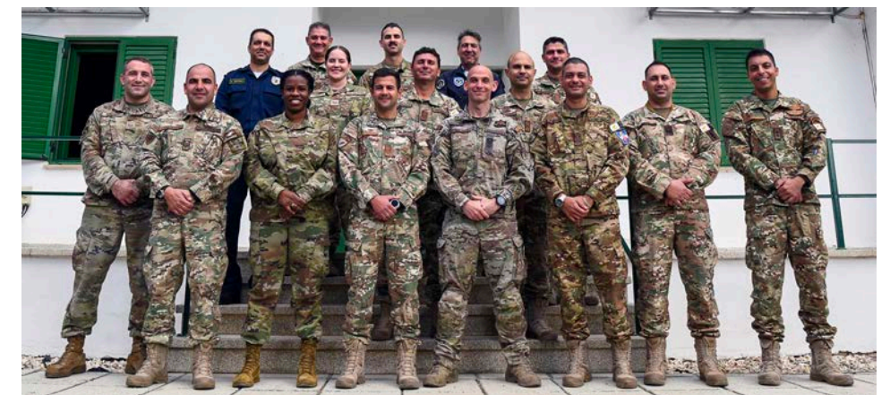
U.S. Air Force Airmen with the New Jersey Air National Guard and Republic of Cyprus National Guard members have their photo taken during training at Camp Panteli Katelari, Cyprus, Nov. 21, 2024.

"The State Partnership Program allows us to integrate exercises diplomatically, building effective strategies for common threats," said Ferrie. "It's about learning from one another and preparing for the future."