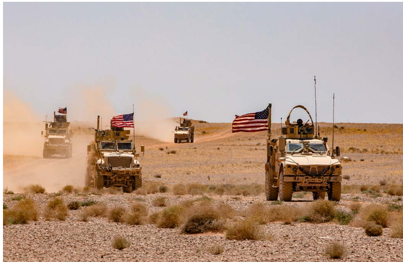
U.S. Army Mine-Resistant Ambush-Protected All-Terrain Vehicles crewed by Soldiers with the 1st Squadron, 102nd Cavalry Regiment, wind their way through eastern Syria in support of