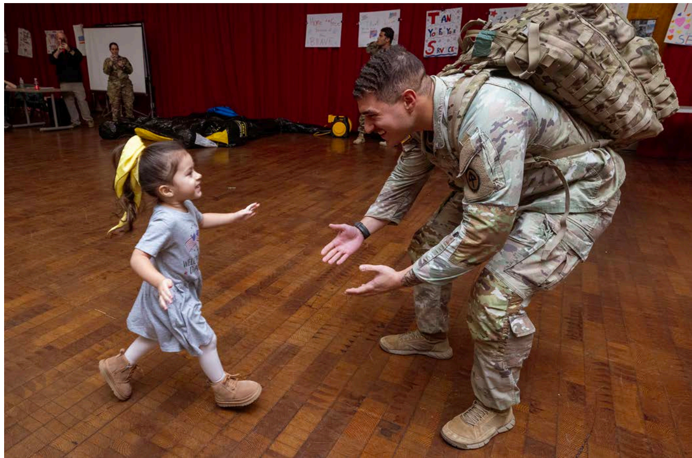
Above and below: Family members and friends are reunited with 200 U.S. Army Soldiers with the 44th Infantry Brigade Combat Team, New Jersey Army National Guard, at the