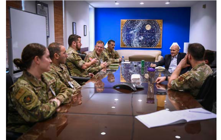
U.S. Air Force New Jersey National Guardsmen and members of the National Guard of the Republic of Cyprus participate in leadership training at Camp Panteli Katelari, Cyprus, Nov. 22, 2024.

Future initiatives include monthly engagements and joint summer training events involving Cyprus, Albania, and the New