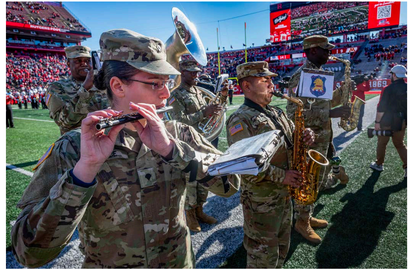
U.S. Army Soldiers with the 63rd Army Band, New Jersey Army National Guard, perform during the halftime show at the Rutgers University's military appreciation game at SHI Stadium in Piscataway, New Jersey, Nov. 9, 2024.