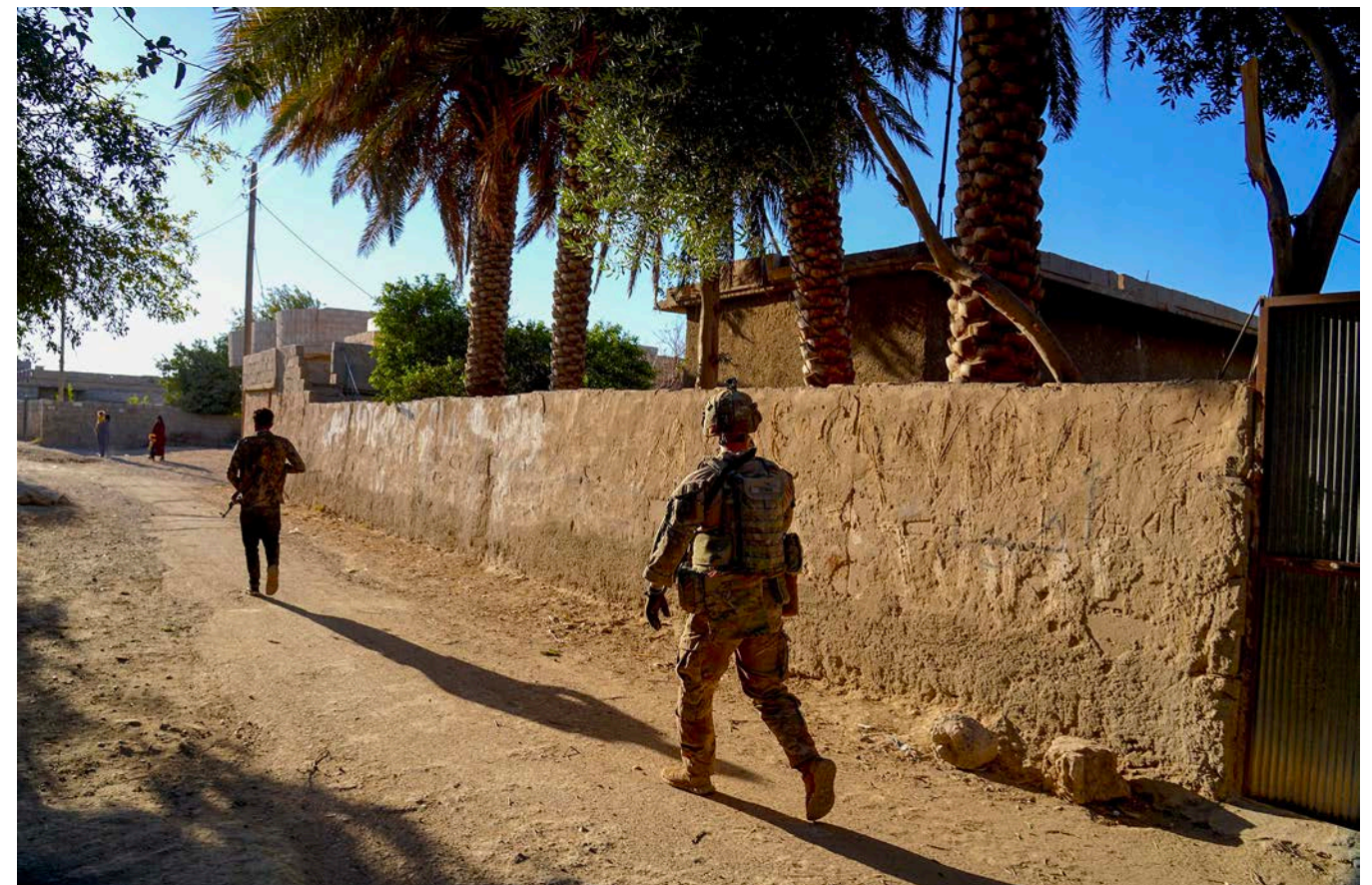
Above: U.S. Army Soldiers with 1st Battalion, 114th Infantry Regiment, conduct a foot patrol with Syrian Democratic Forces in northeast Syria, Oct. 24, 2024.

U.S. Army Soldiers with the 1st Battalion, 114th Infantry Regiment, 44th Infantry Brigade Combat Team, New Jersey Army National Guard, conduct security operations in cooperation with Syrian Democratic Forces in Northeast Syria, Oct. 24-25, 2024. Security operations such as foot patrols provide stability for the local populations and prevent a resurgence of ISIS in the Combined Joint Task Force - Operation Inherent Resolve area of responsibility.