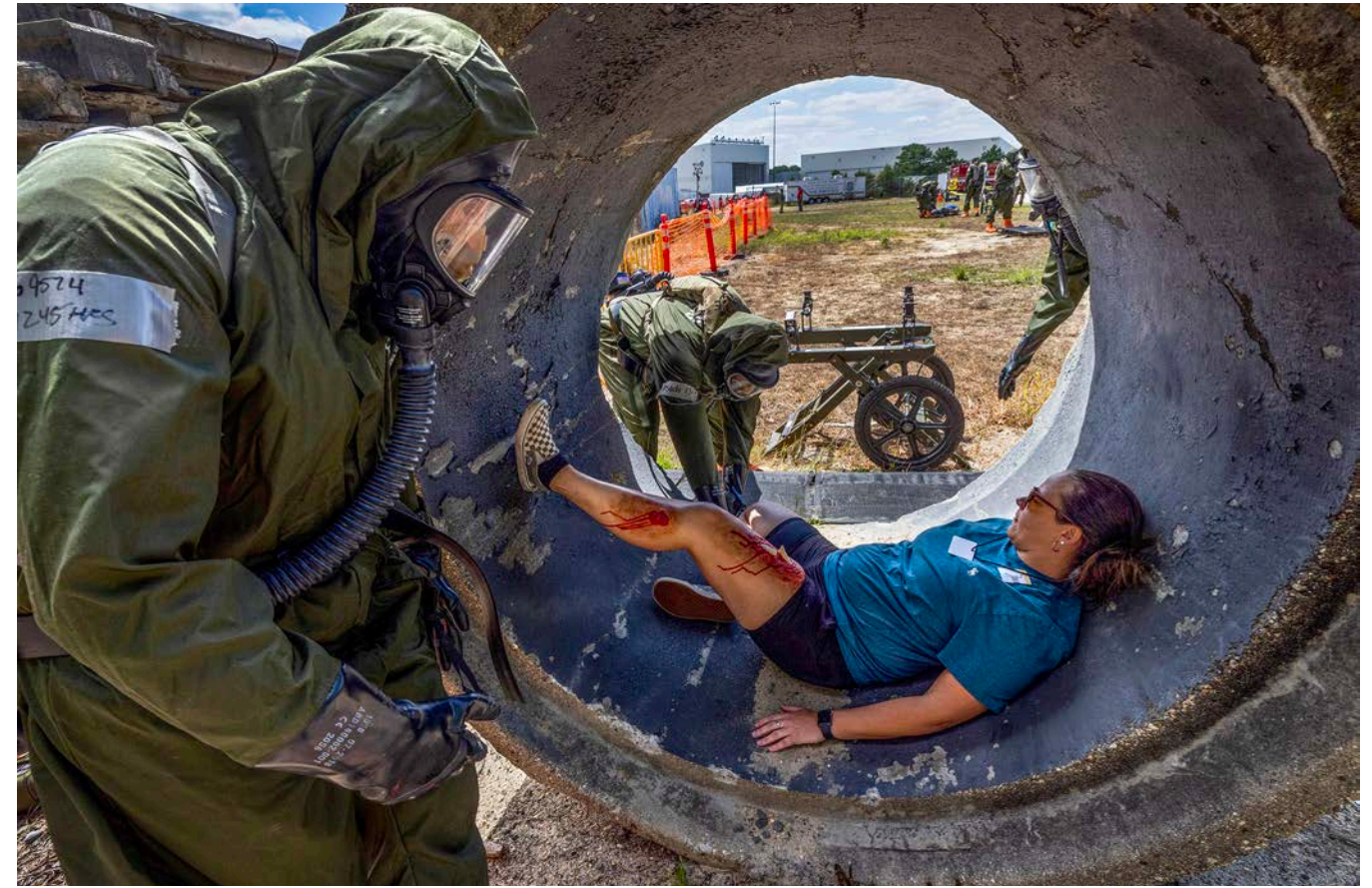
Above: U.S. Army National Guard Soldiers with the Massachusetts Chemical, Biological, Radiological, and Nuclear Task Force rescue a simulated casualty during Vigilant Guard 24 – NJ at Joint Base McGuire-Dix-Lakehurst, New Jersey, Aug. 20, 2024.