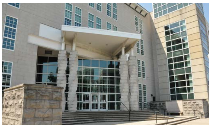
The Middlesex County Family Courthouse in New Brunswick as it appears today.

The county seat was moved to New Brunswick in 1793