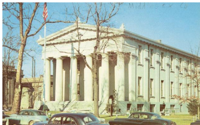
The old Middlesex County Courthouse, which occupied a block bordered by Bayard, Paterson and Kirkpatrick streets and Elm Row in New Brunswick.