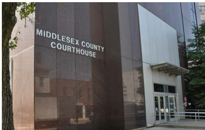
The Middlesex County Courthouse in New Brunswick as it appears today.