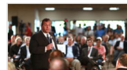
Fairness Formula Town Hall - New Monday, October 18, 2016 Providence