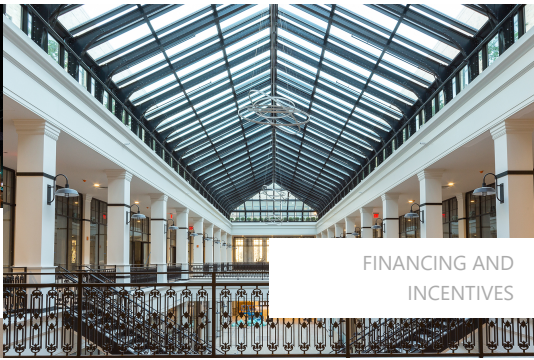
FINANCING AND INCENTIVES