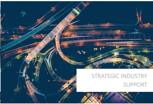
STRATEGIC INDUSTRY SUPPORT