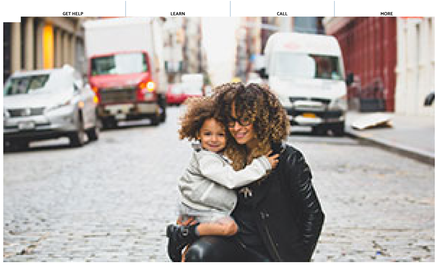
READ STORIES OF HOPE & RECOVERY