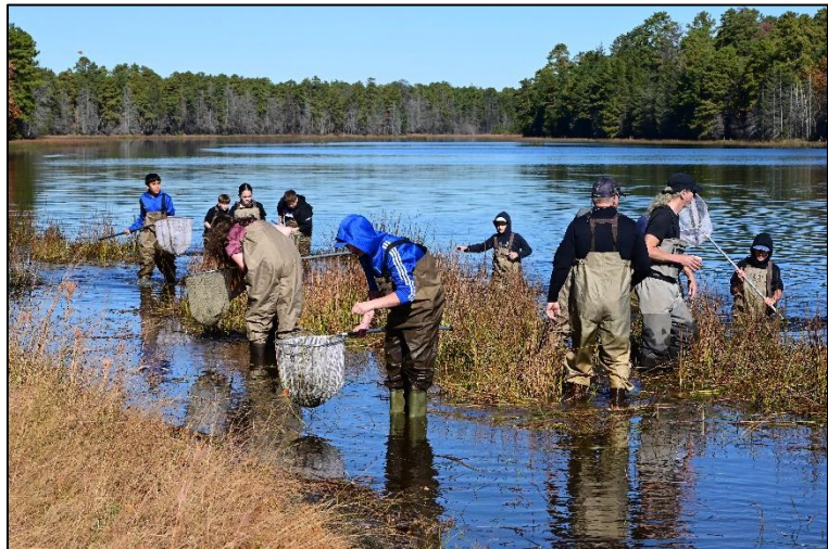
Above: Commission staff educated almost 100 students from Hammonton Middle School during the annual World Water Monitoring Challenge at Batsto Lake on October 25, 2024.