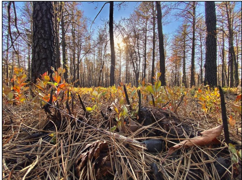
Above: A transmitter taped to the tail of this pine snake will lead staff to the hibernacula location. This method is used when surgeries cannot be performed due to the lateness of the season.