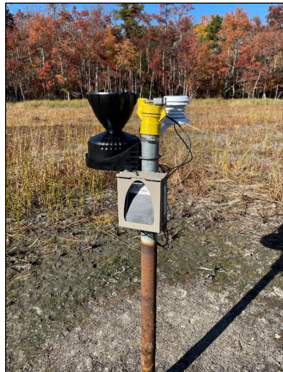
Above: This solar-powered weather station was installed in a continuous monitoring pond that currently has no standing water due to drought conditions.