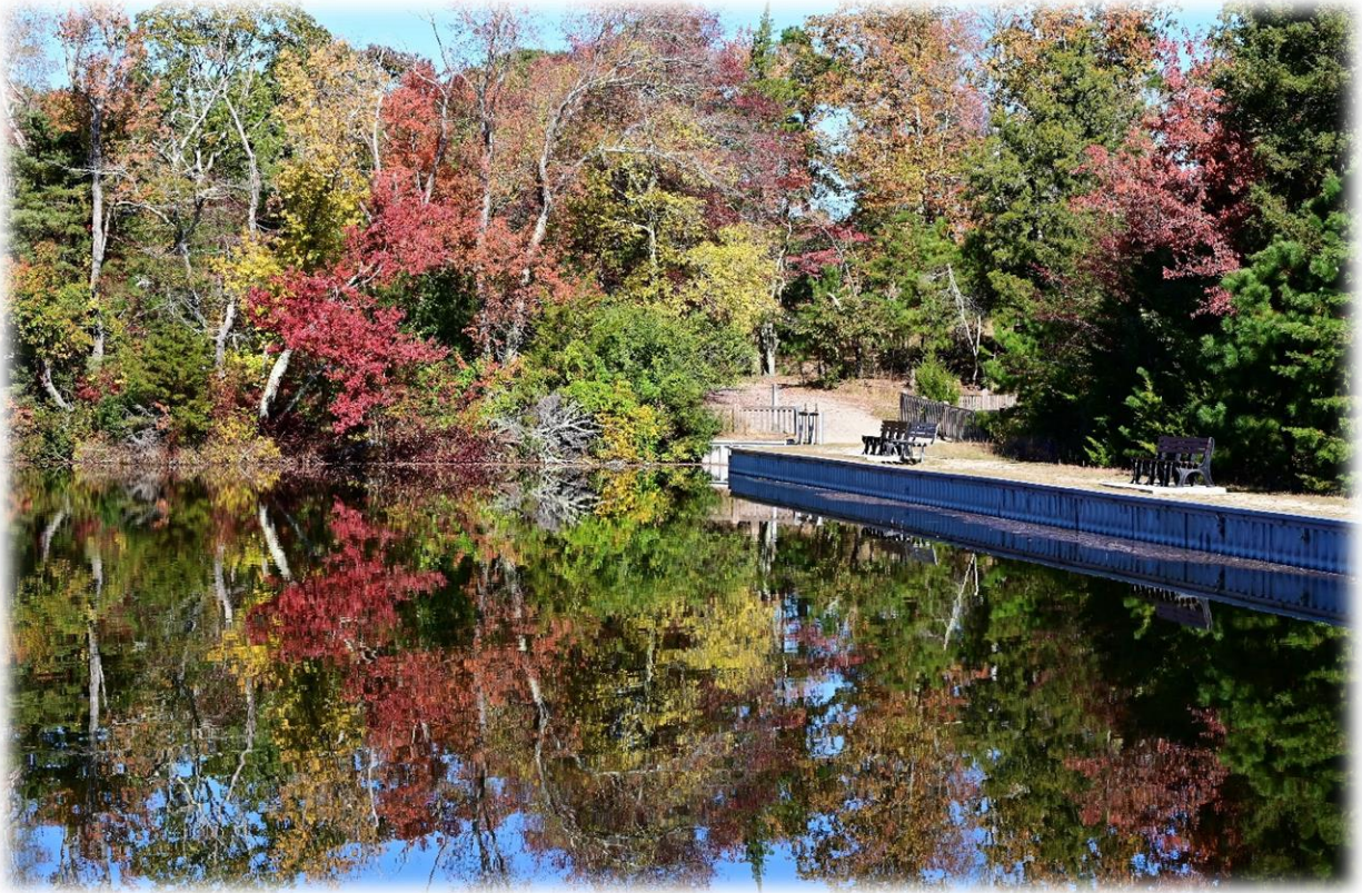
Reflections of fall foliage on Wells Mills Lake in Wells Mills County Park in the Pinelands, as photographed in October