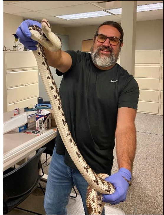
Above: Staff continue to assess snakes, such as this pine snake, for overall health and the presence of adenovirus and snake fungal disease.