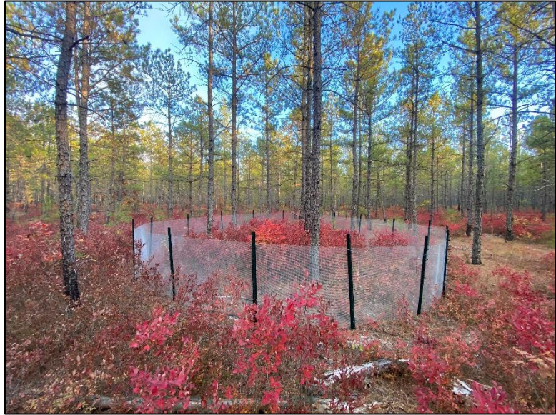
Above: Corrals installed at hibernation sites enable staff to monitor and assess snakes in the fall when snake prepare to enter hibernacula.