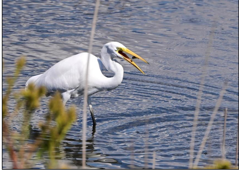
Above: Commission staff shared 53 tweets in October 2024, including a tweet with this photo of a great egret eating a fish at the Edwin B. Forsythe National Wildlife Refuge in the Pinelands National Reserve.