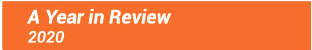
Opioid ResponseReport 2020 [pdf]