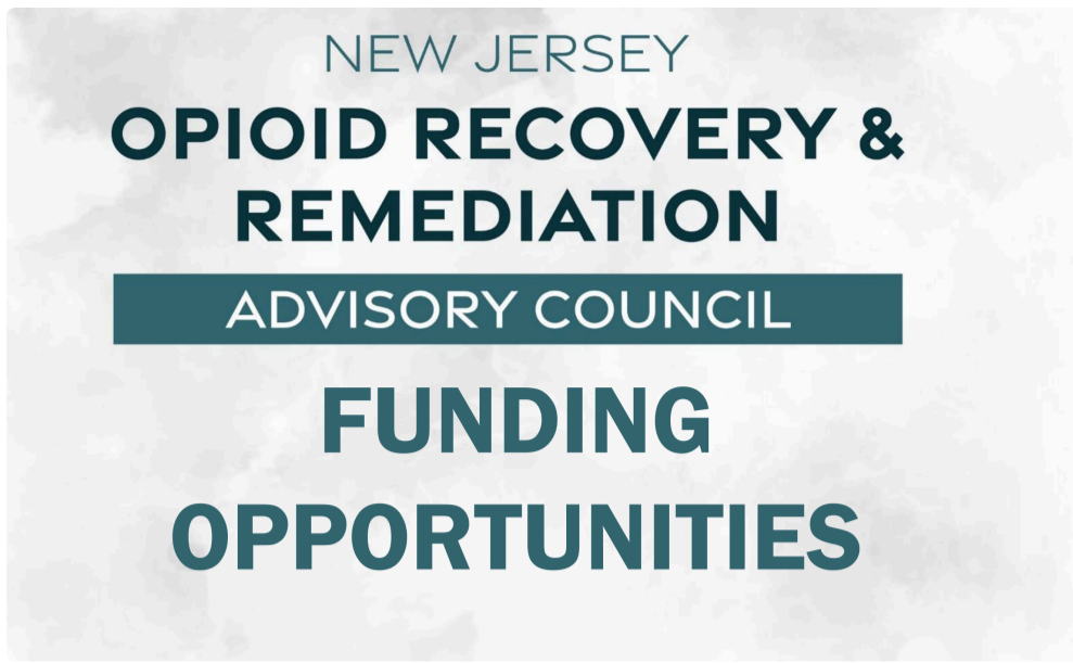
Funding Opportunities Through Settlement Dollars