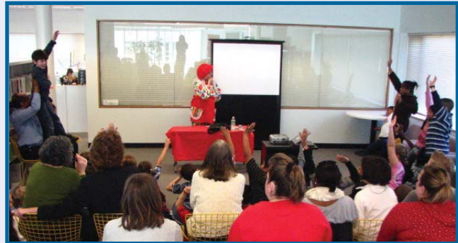
Students volunteering to put on clown makeup.