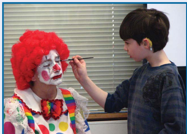
MKSD student lending a helping hand.