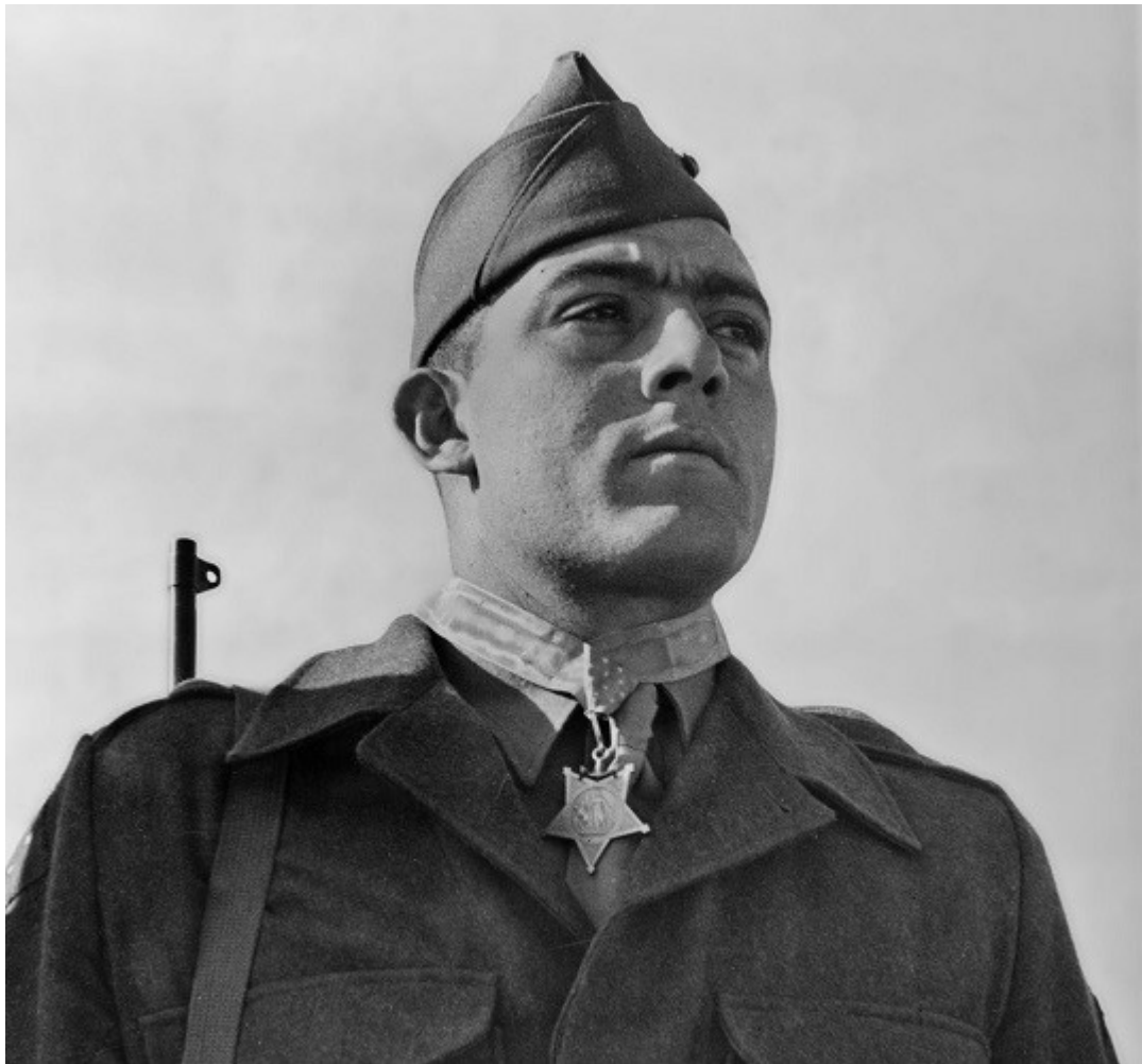
Sergeant John Basilone