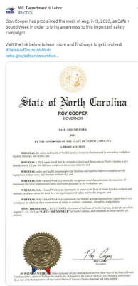
N.C. Department of Labor