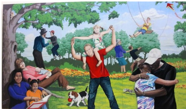
The exhibit is the newest of several that adorn the walls in the two courthouses in the Middlesex Vicinage. Other exhibits document the history of New Brunswick, explain the state's judicial system, and describe general equity cases and family life through the eyes of children.