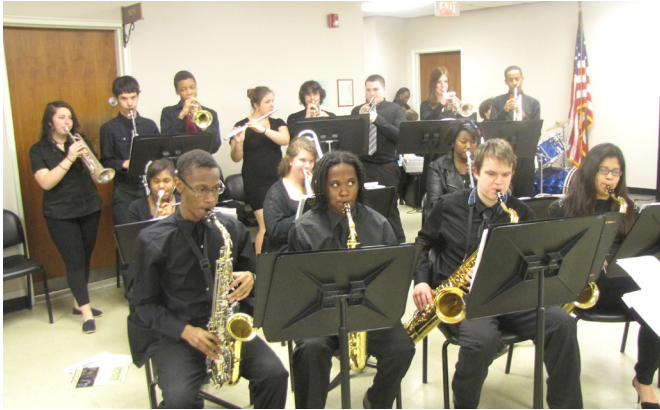
The Neptune High School Jazz Band performed several selections during the Monmouth Vicinage Black History Month program.