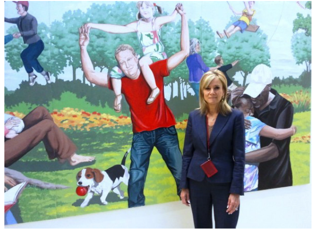
Middlesex Vicinage Presiding