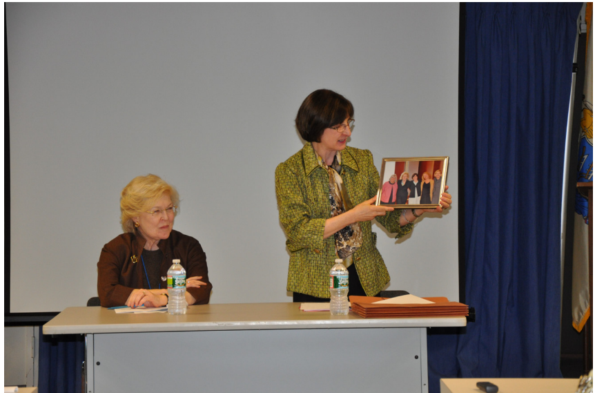
New Jersey Supreme Court Associate Justice Jaynee LaVecchia holds a photograph taken of the five women who at the time comprised a majority of the court. Appellate Judge Mary Catherine Cuff, who is temporarily assigned to the Supreme Court, is seated.

aspiring female attorneys was removed during the Vietnam War in the late 1960s. The military exemption to the draft was ended, opening seats in law schools that would have been occupied by men and prompting large numbers of women to enroll.