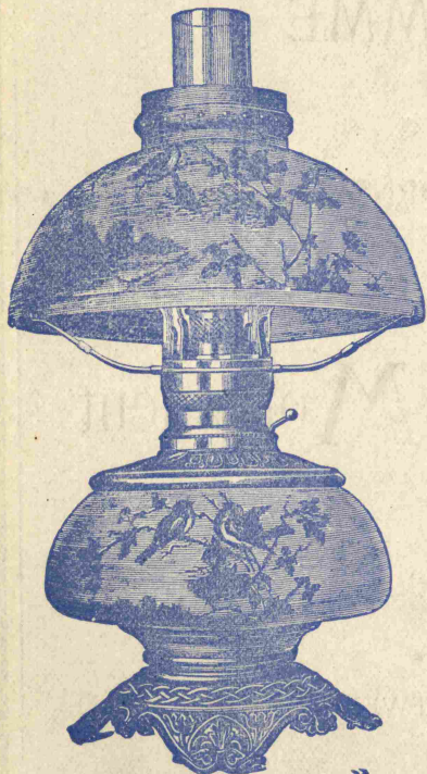
"THE TRENTON" CENTRE DRAUGHT PARLOR LAMP.