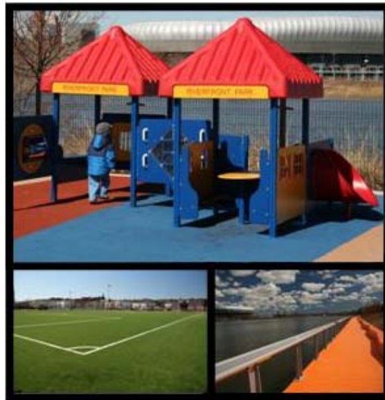
Essex County Riverfront Park, Newark

With district-by-district tables on park development grants