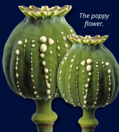
The poppy flower.

"Opioids", as a category, derives from the natural substances within the opium 'poppy' plant. Also known as opiates or narcotics, the mechanism by which they work is by activating nerve cells in the brain and body called opioid receptors . These receptors block pain signals between your brain and the body. The most common variants are morphine, codeine, oxycodone, and heroin. Often a drug like morphine can be prescribed by medical professionals for post surgery recovery. Hydrocodone is prescribed for chronic pain and as a cough suppressant. In a time before the Food and Drug Administration and the Controlled Substances Act , heroin itself was commonly sold over the counter as a remedy for coughs and pneumonia . The drug you likely hear about most in the daily news cycles these days is fentanyl. In 2023, over 115 million pills containing illegal fentanyl were seized by law enforcement. That same year, fentanyl contributed to over 70,000 drug related deaths . This synthetic opioid is pound for pound fifty times stronger than heroin and one hundred times stronger than morphine. According to the U.S. Drug Enforcement Administration, about two milligrams of fentanyl (a quantity so small it could fit on the tip of a pencil) is considered a potentially lethal dose for many people. Fentanyl is often mixed with other drugs or substances, so a big danger is an individual