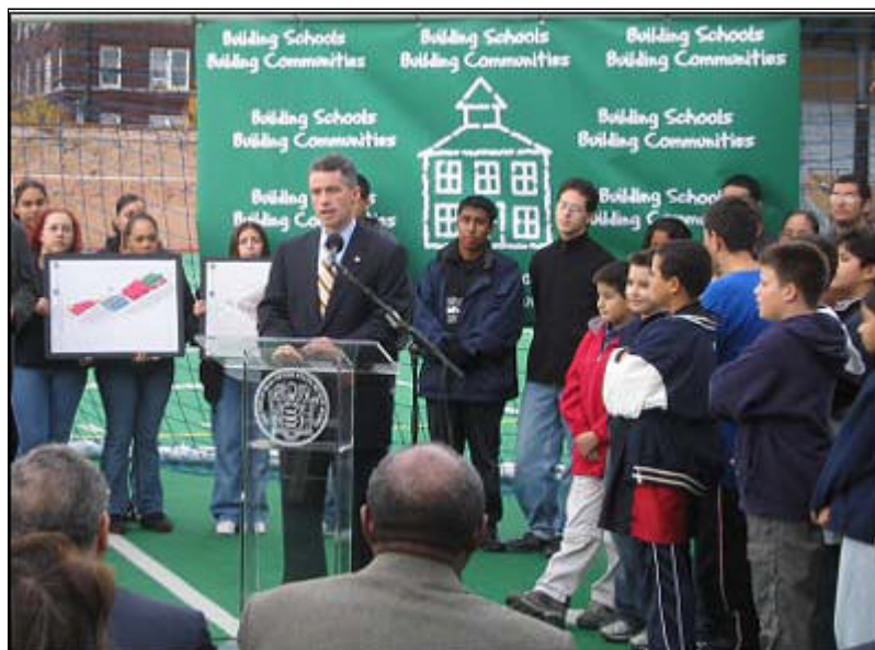
Governor announces preliminary Demonstration Projects designation in Union City

On October 29th, Governor McGreevey announced the preliminary designation of 6 Demonstration Projects, which leverage school construction funding to bring in private investment and revitalize entire neighborhoods with new housing and retail opportunities. The School Construction Corporations Board of Directors held a Special Meeting on October 30th