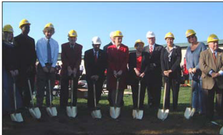
Neptune High School Groundbreaking