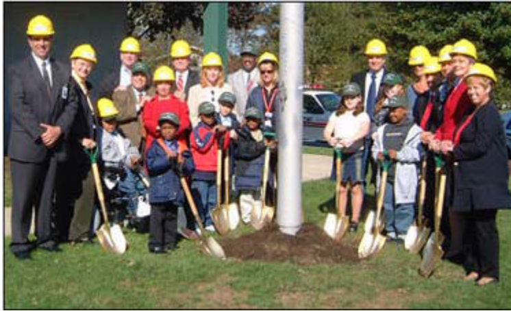
Green Grove Road Elementary School Groundbreaking