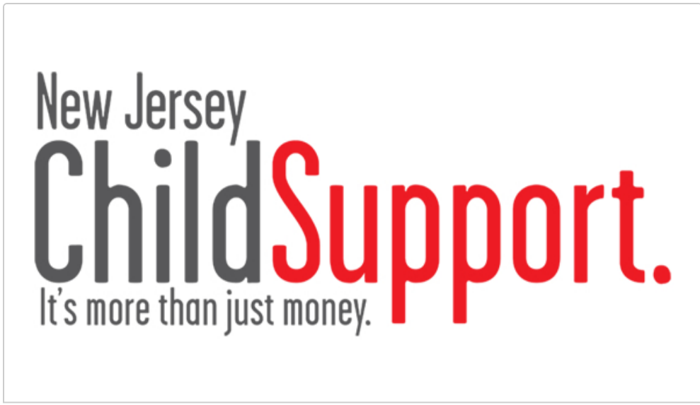
NJ Child Support

There are now more ways to pay child support