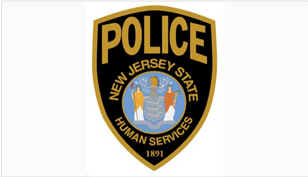
Human Services Police

New Jersey's publicly funded health insurance program