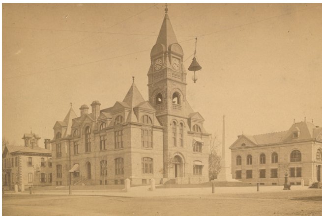
The Gloucester County Courthouse in Woodbury as it appeared early in the 20th century.

The Justice Complex on Hunter Street was built in 1983. An expansion and renovation project that included the construction of nine new courtrooms and the renovation of four existing courtrooms was completed in 2010. The Family Courthouse at Broad and Cooper streets was built in 2001.