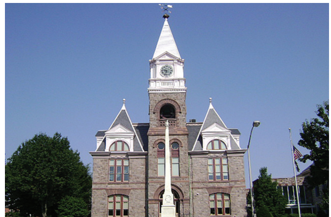
The Gloucester County Courthouse as it appears today.