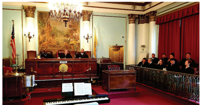
Union Vicinage judges are pictured during Law Day ceremonies in the Union County Courthouse.