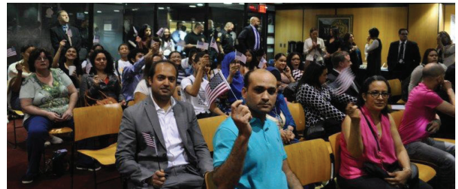
New U.S. citizens wave American flags in celebration during a naturalization ceremony in Passaic Vicinage.

The day's events included a community outreach session in the rotunda of the Historic Courthouse. Local service agencies along with the bar association, the county and the Judiciary, staffed tables with information for the public.