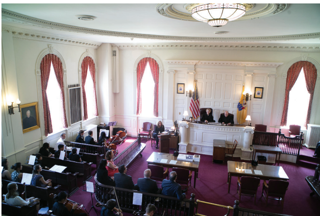
A view of the courtroom in the Morris County Courthouse where the Law Day ceremony was held.