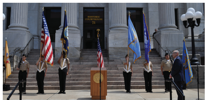
An honor guard bears the American flags and the flags of the armed services.