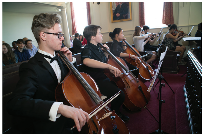
The Morristown High School Vocal and String Ensemble performed during the celebration.