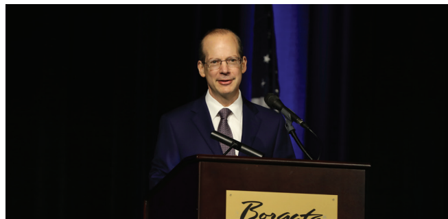
Chief Justice Stuart Rabner addresses the New Jersey State Bar Association convention.