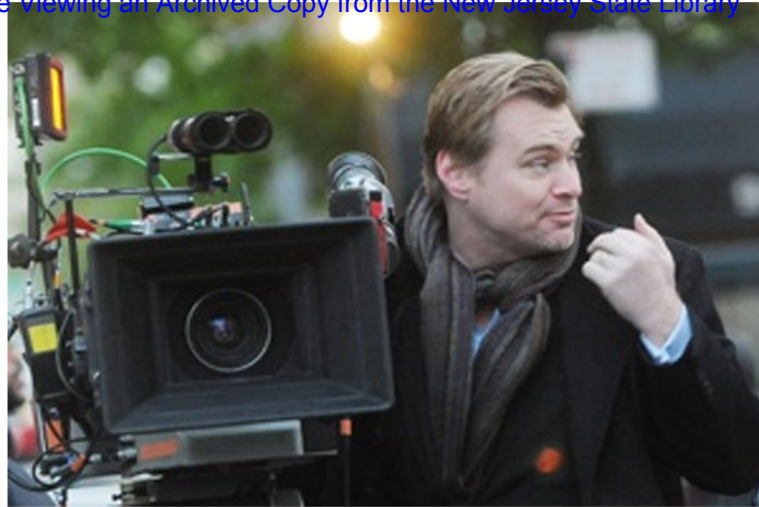
Christopher Nolan in Newark, directing scenes from the Warner Bros. feature The Dark Knight Rises .