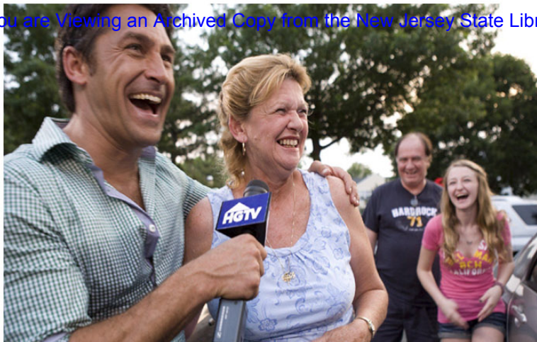
An episode of the HGTV series Dream House was filmed in Sayreville.