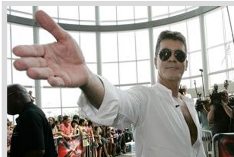
Simon Cowell greets fans at the Prudential Center in Newark, during taping of auditions for FOX's The X Factor .