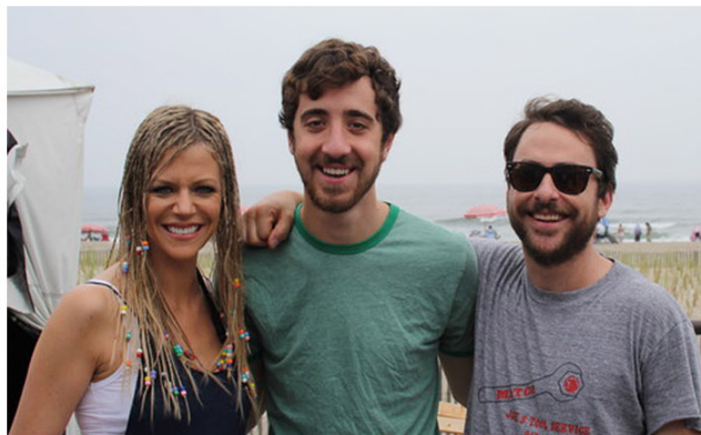
Kaitlin Olson (l) and Charlie Day (r) greet residents of Ocean City, while filming an episode of FX Network's It's Always Sunny in Philadelphia .