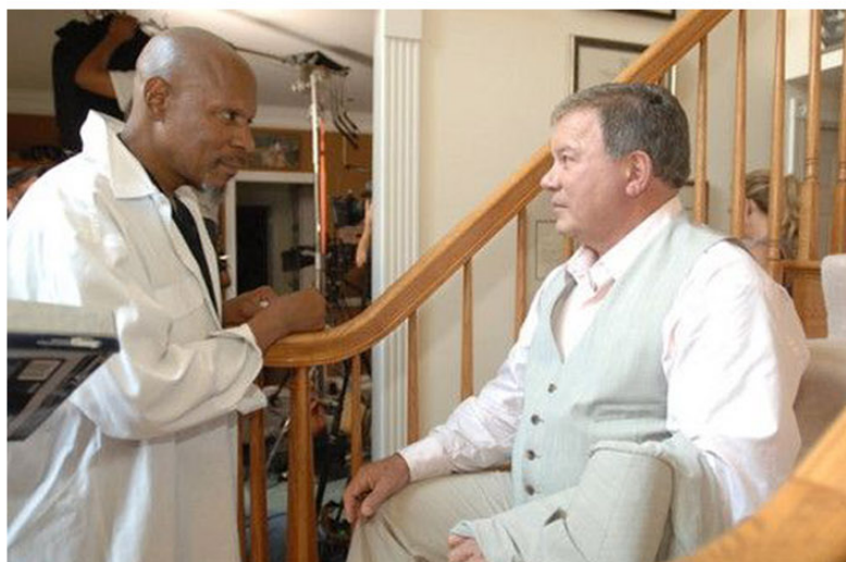
Scenes from William Shatner's Star Trek documentary The Captains , featuring Avery Brooks, were filmed in Princeton.