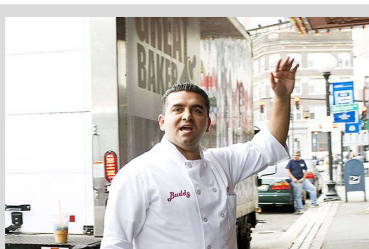
TLC's The Next Great Baker , featuring Buddy Valastro, is filmed in Jersey City.