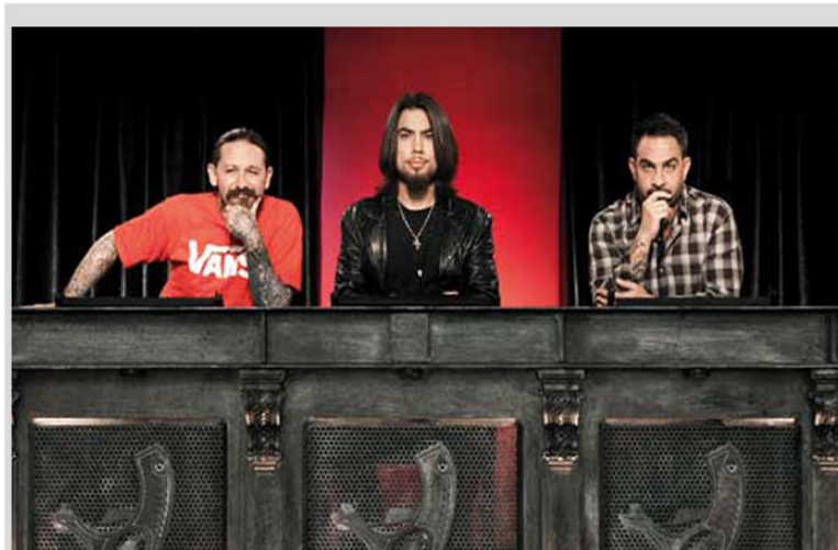
Oliver Peck, David Navarro and Chris Nunez are the judges on Season One of Spike TV's Ink Master , filmed entirely in Newark.