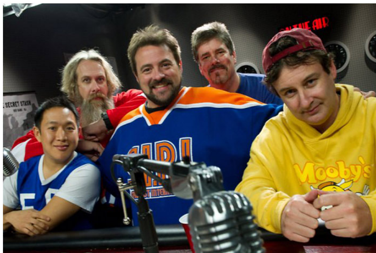
Kevin Smith produces and appears in AMC's reality series Comic Book Men , shot at his Red Bank collectibles store Jay and Silent Bob's Secret Stash.