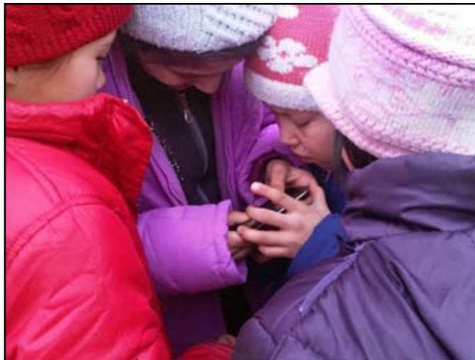
Kyrgyz children at the Niz Orphanage play with an I-Phone.

The orphanage is one of 10 organizations, which include schools and children's heart and cancer centers; supported by MABOS, a non-profit base community service organization. During the visits, Airmen bring toys, clothes, school supplies and text-