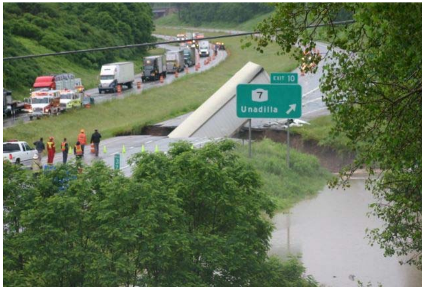
Collapse of New York State Thruway (I-88) due to culvert failure on June 28, 2006

Culvert pipes play a vital role in transportation infrastructure by facilitating safe drainage. The ramifications of culvert failures range from a temporary roadway closure to a catastrophic event with the attendant loss of human life. In that regard, the decision making process for preventative maintenance, i.e., to inspect, repair, replace, or no-action is key for both safety and cost savings considerations. However, the current inspection method is very expensive and time consuming. Hence, a new and properly developed Infrastructure Information Management System was developed to address these issues and to meet the Governmental Accounting Standards Bureau (GASB-34) requirements, as well as, saving tax payers' money.