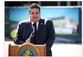
County DPW Groundbreaking September 20, 2013