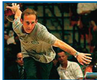
Norm Duke, PBA Player of the Year 2000

Association (PBA) Summer Series! This event will feature 15 of the world's greatest bowlers competing on specially-constructed lanes in a rare outdoor setting that will air throughout the summer on Entertainment and Sports Programming Network (ESPN).