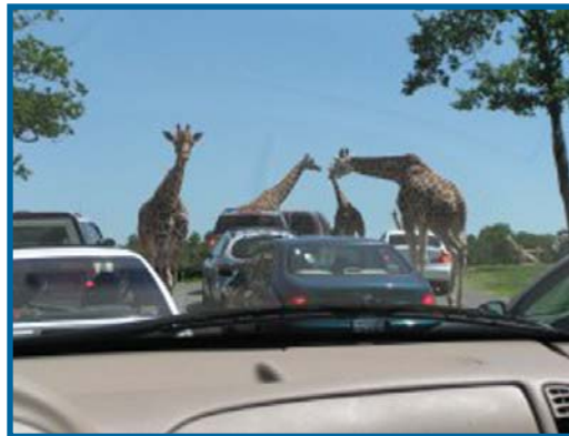
Giraffes stroll down Safari Drive

Best Bowler and ranked 7th on the PBA's 2008 list of "50 Greatest Players of the Last 50 Years." The roster also includes left-handed, American professional bowler,