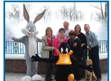
DDHH Staff members enjoy Annual Deaf and Hard of Hearing Awareness Day

an up-close encounter you'll never forget. While your there, stop by Exploration Station and learn about conservation through hands-on experience with some favorite creatures.