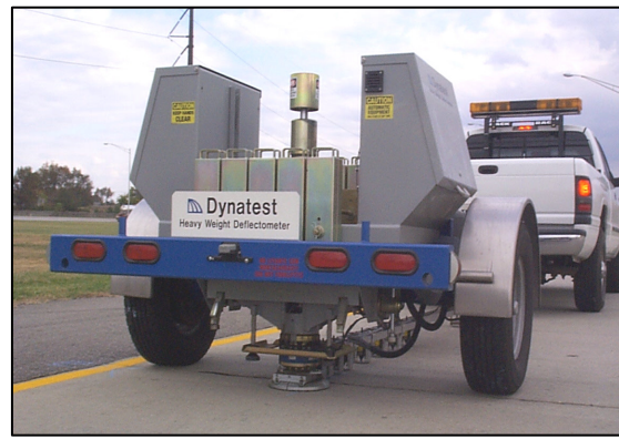
FWD Pavement Evaluation

A comprehensive analysis was performed on the collected FWD, SPA and environmental data from test sites to investigate the impact of the environmental parameters on pavement response. As expected, results of the Analysis Of Variance (ANOVA) performed on the pavement parameters (deflections and backcalculated moduli) and environmental parameters (base course moisture content, average Asphalt Concrete (AC), temperature, ground water table (GWT), rainfall, and air temperature) indicated that all main environmental parameters have a significant impact on the Effective Pavement Modulus ( E_p ) and Subgrade Modulus ( M_r ), with the exception of GWT and pavement temperatures, which do not have significant impact on the subgrade modulus. This finding does not agree with the common assumption made in backcalculation analysis that GWT acts as a rigid layer.