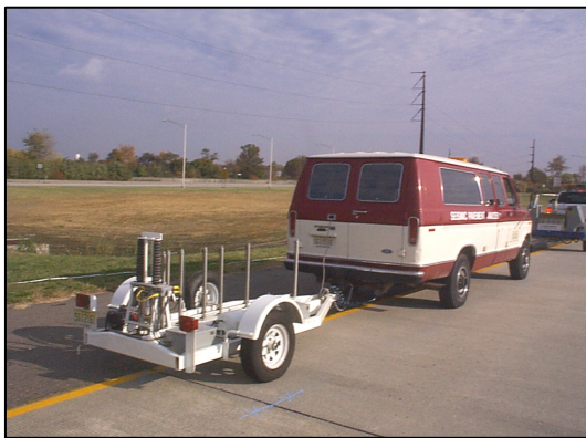
SPA Pavement Evaluation