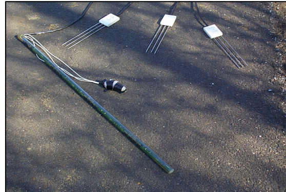
Tipping Bucket, Solar Panel, and Air Temperature Probe TDR and Temperature Probes