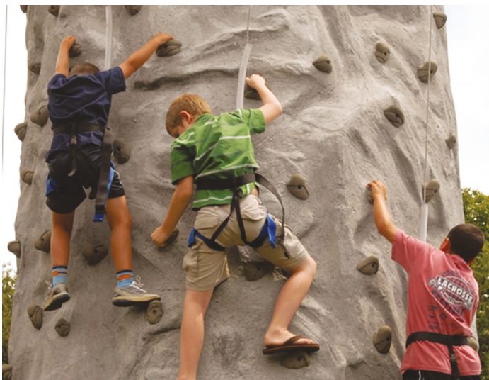
Children of fallen Soldiers enjoy the National Guard rock climbing wall as part of the activities for families at a joint-service Survivor Outreach Services (SOS) Picnic on Aug. 13 at the DMAVA campus in Lawrenceville.. Attendees were treated to lunch, music, and activities such as a rock-wall climb, face painting, bean-bag toss, volley ball, and arts and crafts for the children.